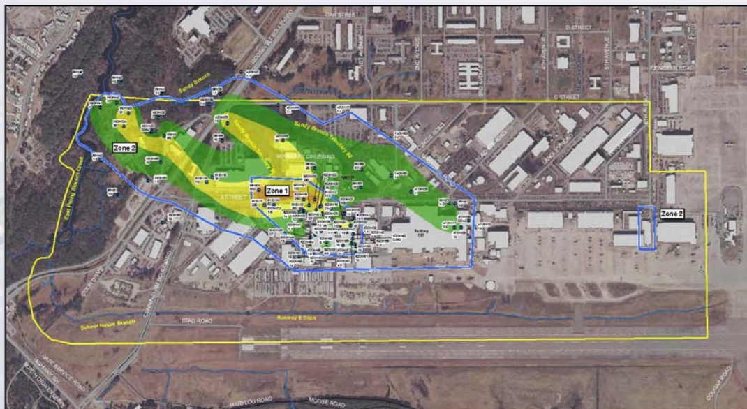
Contaminant Concentration Map illustrating the Central Groundwater Plume and its relation to Operable Unit 1, as well as the delineation of the two separate treatment zones.

evaluate practical remedial alternatives. The treatment area was divided into two separate treatment zones. Zone 1, the Near Source Zone, comprised the former plating shop and areas of the highest dissolved phase contaminant concentrations. Zone 2, defined as the Downgradient Zone, comprises the rest of the Central Groundwater Plume between Zone 1 and the surface water body of Slocum Creek and contains the lowest concentrations of dissolved phase contaminants. The Remedial Action Objectives associated with Zone 1 consists of a reduction of near source Contaminants of Concern (COCs) by at least 70% in ten years or less, and reducing the mass flux of contaminants into the central portion of the groundwater plume and preventing discharge of groundwater exceeding NC 2B standards to surface water. The objective of Zone 2 consists of further treatment of the downgradient plume and preventing the discharge of groundwater exceeding the NC 2B standards to surface water.