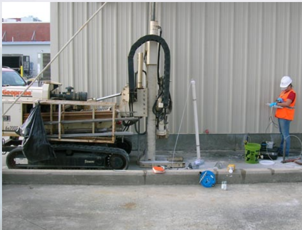
Installation of Soil Vapor Probes during Phase 1 of the VI Investigation

and soil-vapor sampling. A review of the Phase 1 sampling results highlighted 14 buildings that would require an additional Phase 2 investigation due to possible Vapor Intrusion pathways.