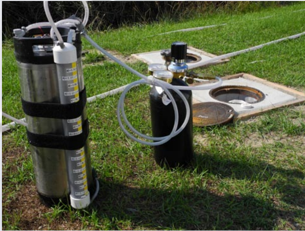
Injection of the Bioaugmentation Culture into surficial groundwater wells to accelerate biodegradation of VOCs

tetrachloroethene (PCE) and its daughter products into the non-harmful end product ethene.