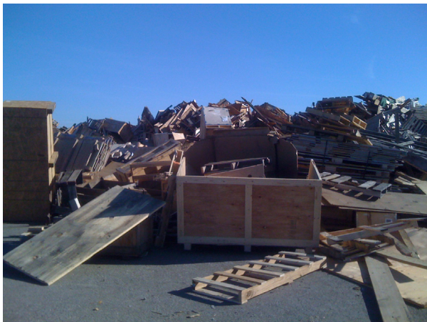
Excess scrap wood from distribution operations in the recycling yard - before processing

The recycling process is a difficult and often unprofitable business. Since it is or should be the desire or purpose of any business to make a profit, the Technical Merits of the DLA San Joaquin Recycling Program/ Team may best be demonstrated by looking at our fiscal performance for FY11. In this one