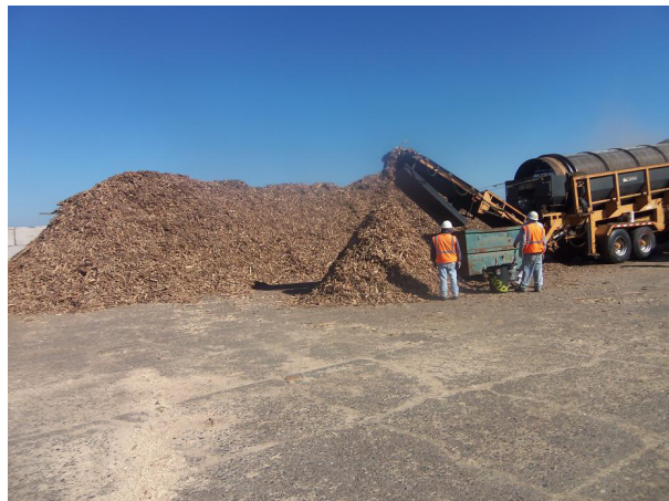
Same wood being chipped for reuse as landscaping, pet bedding, particle board etc.