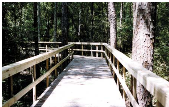
Constructed 300' Nature Trail Boardwalk for public-use NR Education and recreational fishing; designed by SCA students and built in-house using NR funding.