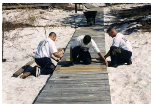
Navy Enlisted Students volunteering