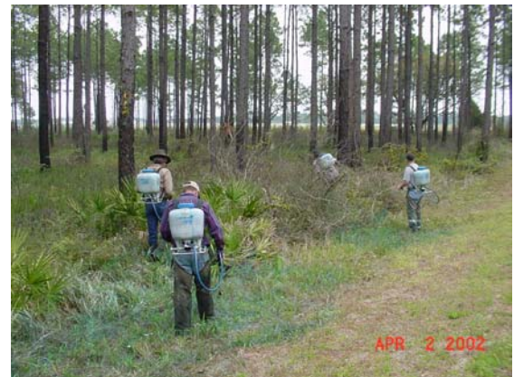
National Park Service partners with Navy to control cogongrass and other invasive species.