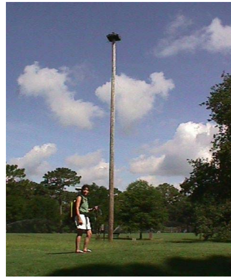
19 artificial Osprey nestboxes strategically located reduced BASH problems and significantly increased area Osprey population.

The Area Osprey Restoration Project best demonstrates the Navy’s regional influence upon the management and conservation of the ecosystem. During the 10-year period from 1985-1992, only three Osprey chicks were successfully fledged at NAS Pensacola. From 1993-1997, six chicks were fledged each year. From 1998-2000, however, a total of 28 chicks were fledged in a combination of 14 artificial platforms and two natural nests. From 2001 - 2003, new platforms were added and over 20 fledglings were produced each year. Osprey nesting platforms are located to reduce bird strikes in aviation patterns.