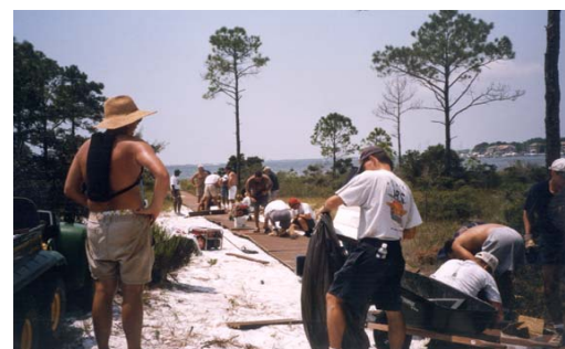
Navy Chiefs construct 500' extension to Trout Point Nature Trail; expanding public-use and handicapped access.