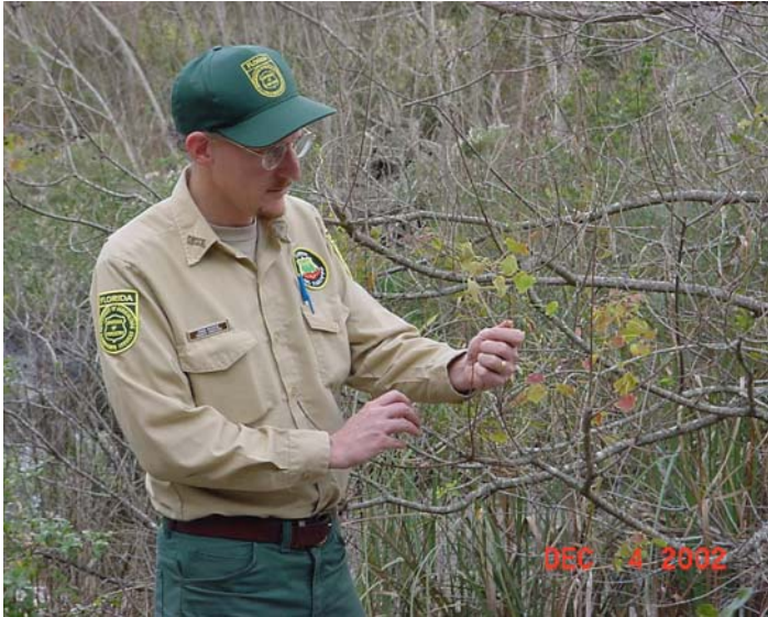
Florida Division of Forestry inspects effectiveness of Invasive Species Control for Chinese Tallowtree