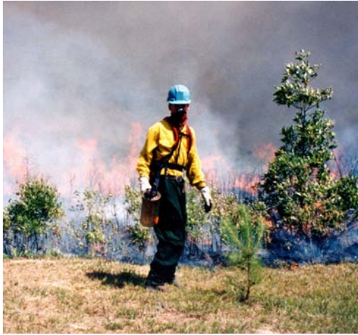
Navy SCA Student supporting Regional Ecosystem Restoration Prescribed Burn at Garcon Point Preserve.