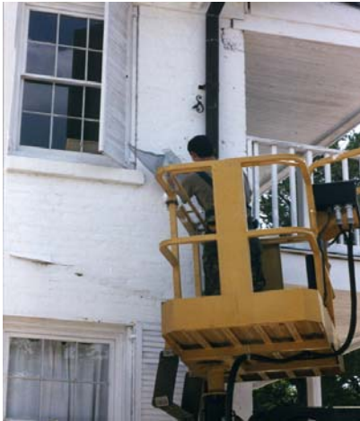
Honeybee Swarm Removal: 100+ swarms removed and saved from buildings and aircraft without using pesticides.