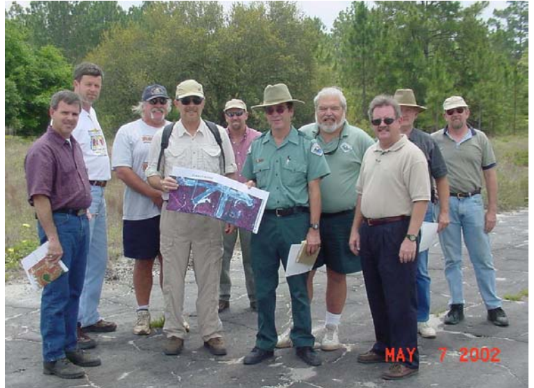
Navy, Florida Department of Environmental Protection, and Florida Park Service determine Land Management alternatives at NOLF Bronson, adjacent to the Pitcher Plant Prairie 7,000 acre preserve