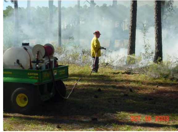
Prescribed Burn at Corry