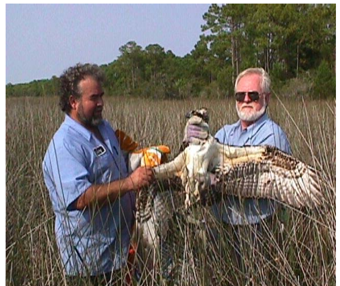
Osprey rescued by Navy Public Works Center from entangled fishing line (NAS Pensacola).