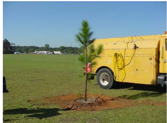
New trees established