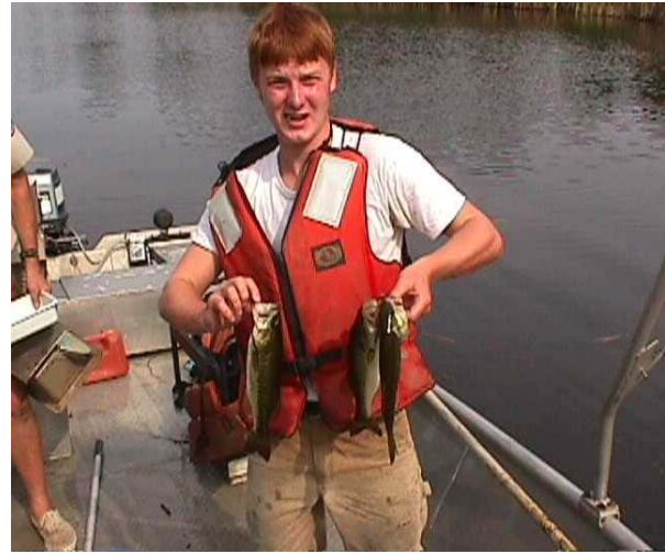
SCA Student coordinated the renovation and improvement of the Lake Frederic Freshwater Fishery.