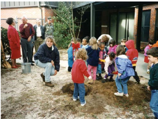
Tree Planting at Child Development Center