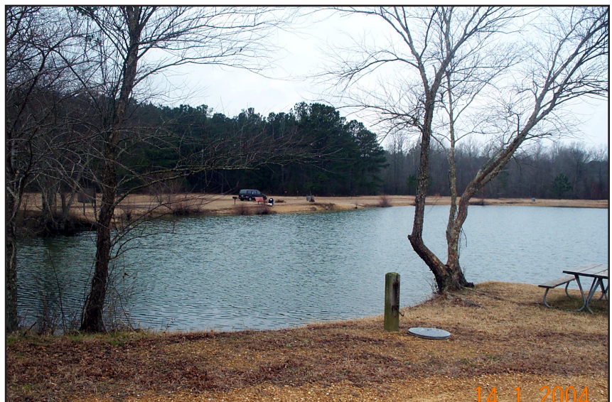
▲ SAC Lake