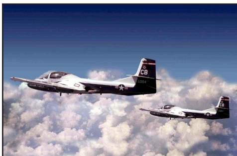
▲ T-37 Aircraft

Columbus AFB is recognized as the Air Force’s leader in natural resource conservation. The bases knowledgeable staff members capitalize on available resources and partnerships, using sound management principles and implementing projects that achieve the ultimate goal of creating harmony between flying aircraft and natural resource conservation.