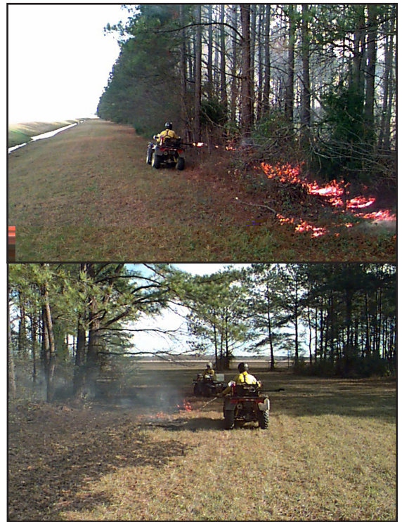
▲ The first prescribed burn was conducted at Columbus AFB in 2001.

Columbus AFB proactively recognized the devastating damage that could be caused by pine beetle infestation and provided effective thinning to selected base areas.