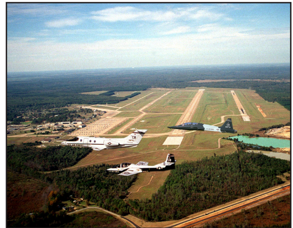
▲ T-37, T-38, and T-1 aircraft fly over Columbus AFB.