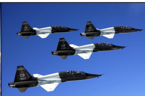
▲ T-38 Aircraft