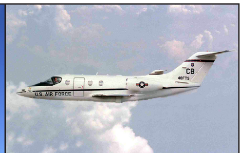
▲ T-1 Aircraft