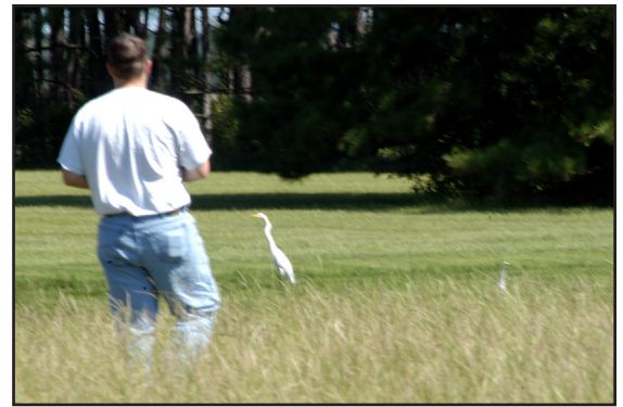
▲ The USDA Wildlife Biologist during a species survey.

The USDA wildlife biologist, in conjunction with Columbus natural resource personnel, conducted deer and avian wildlife surveys. A survey of species of concern (including federally listed, state-listed and special status species) and their habitats will be conducted by Mississippi State University in 2004. The surveys will facilitate proper protection and habitat management for these species and also provide indicators of the biodiversity that exist on Columbus AFB. A state-of-the-art database is being developed to record species observations from these surveys and to calculate species per acre and total populations. The numbers obtained from the deer surveys will help manage deer herds to maintain viable populations