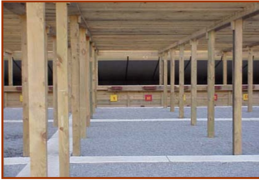
Bullet Trap at B-12 Pistol Range