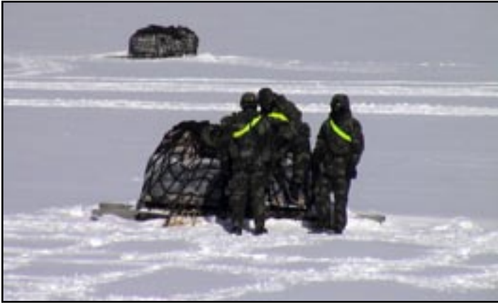
▲ A fisheries expert with USFWS, Kofi Fynn-Aikins, said of the Lake Liming project shown above, "Our relationship with them has been really good and they really care about the environment. The natural resources staff have been really good partners."

FY 2003. A new permit office was established, a computerized photo identification permit card system helped address security concerns, and new regulations were implemented. On average, 2,800 recreationists utilize Fort Drum lands annually with revenues from permit sales averaging $26,000. The outdoor recreation program further bolsters the positive relationship between Fort Drum and local communities, and provides additional quality of life opportunities to Soldiers and their families.