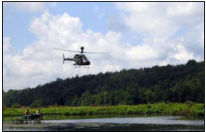
▲ Training and recreation benefit from Fort Drum’s rich natural resources.

The mosaic of natural communities found on Fort Drum provides the US Armed Forces with a variety of realistic training scenarios. For example, forested areas are used for infantry training and as bivouac sites; and forest clearings serve as artillery firing