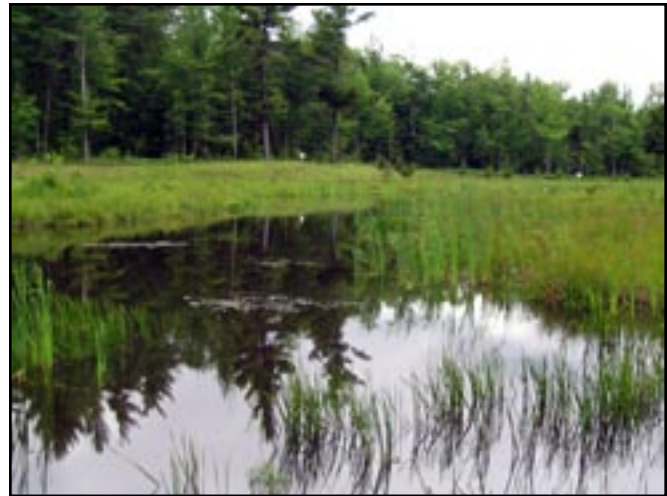
▲ A man-made, compensatory wetland at Fort Drum.

From FY 2003 to FY 2004, Fort Drum raised $425,000 in timber sales, approximately $99,000 of which was derived from local sales, representing the largest amount of local sales in the DoD. A successful firewood program is the largest of its kind and provides low-cost wood to community members and assists the Forest Management Program by removing dead and downed trees. The Forest Management Program uses the NRMU system to coordinate timber sales to maximize benefits to the training community by targeting