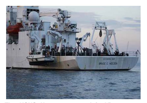
The USNS Heezen operated in Vietnamese territorial waters June 11-25 near Danang on a mission for JPAC and the Vietnam Office for Seeking Missing Persons (VNOSMP).

Information gathered during the Heezen's operations is being analyzed at JPAC.