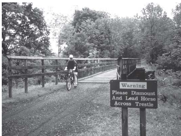
Trail managers cite warning signs as a good risk management technique.

The managing agency should also develop a comprehensive maintenance plan that provides for regular maintenance and inspection. These procedures should be spelled out in detail in a trail management handbook and a record should be kept of each inspection including what was discovered and any corrective action taken. The trail manager should attempt to warn of or eliminate any hazardous situations before an injury occurs. Private landowners that provide public easements for a trail should ensure that such management