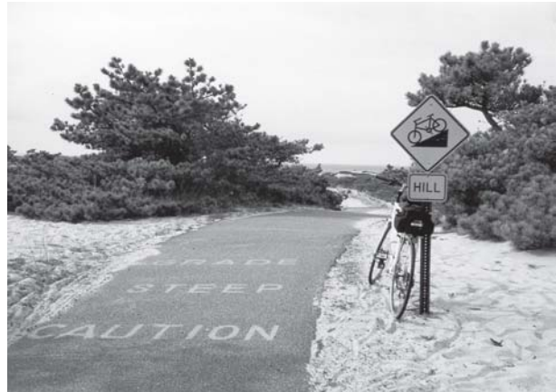
Warning signs help minimize the threat of liability. (John McDermott)

Questions related to legal liability for accidents or injuries on or adjacent to trails must be answered in terms of state common (judge-made) law, 2 which varies from state to state. The following discussion provides a broad overview of trail