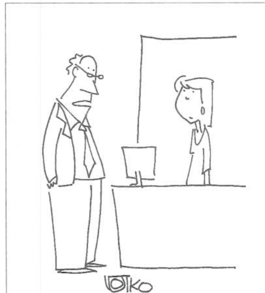
"I'm meeting with the board. Get me the quarterly profit figures and my blankie."