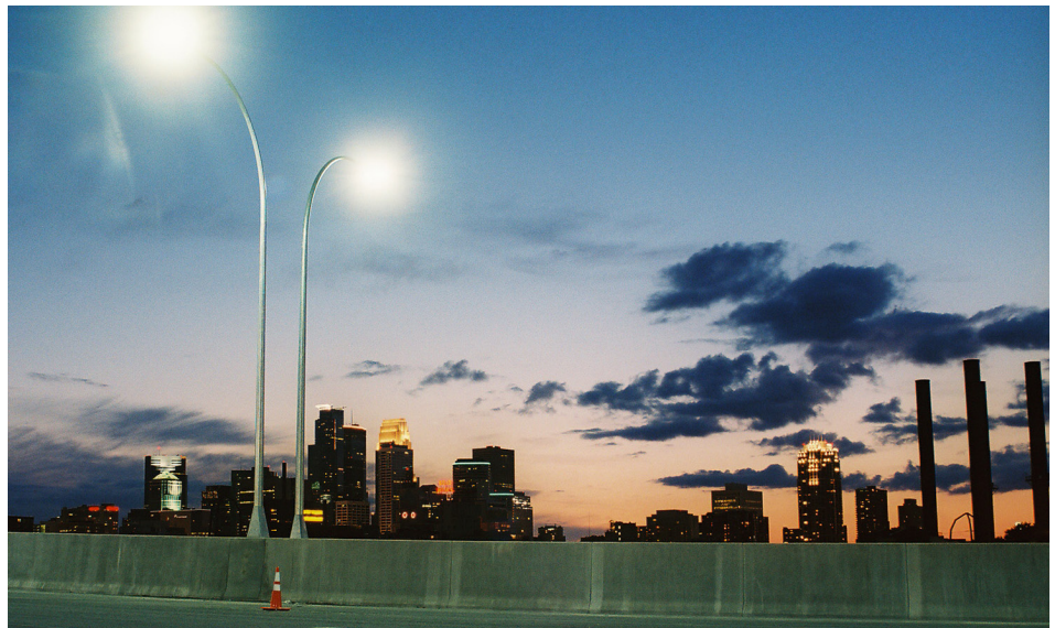
LED roadway installation by BetaLED on the St. Anthony’s I-35W Bridge over the Mississippi River, Minneapolis, MN

http://apps1.eere.energy.gov/buildings/publications/pdfs/ssl/caliper_round4_summary_final.pdf