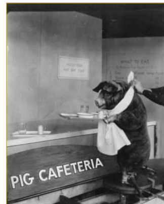
(above) The Pig Cafeteria.undated