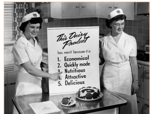
(above) 4-H Presentation, undated, National Archives, Records of the Extension Service