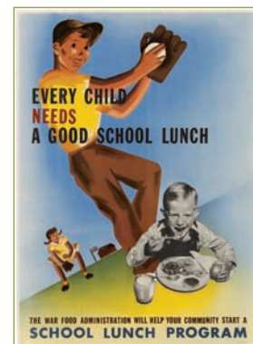
(above) School Lunch Poster, 1944