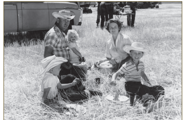
Farm family relaxing in field, undated

“What’s Cooking” explores four areas of Government activities: Farm, Factory, Kitchen, and Table. Farm introduces the vital links between our diet and changing agricultural processes. Factory shows that the U.S. Government began protecting us from unsafe foods in the Industrial Age of the 1800s. Kitchen reveals the importance of government-sponsored research, how our knowledge of nutrition has expanded, and how our eating habits have been influenced by world events. Table investigates the effects of military food, school lunch, and Presidential preferences on daily dinner tables.