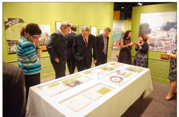
Views of "What's Cooking, Uncle Sam?" as installed at the National Archives in Washington DC