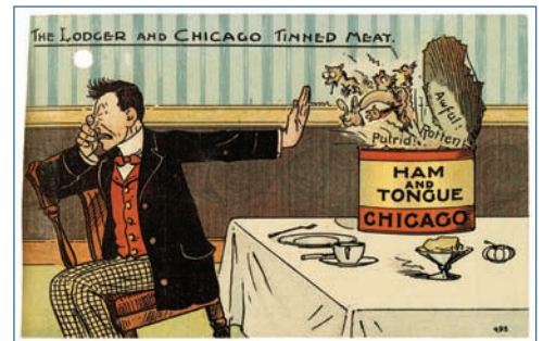
(above) British postcard, circa 1906