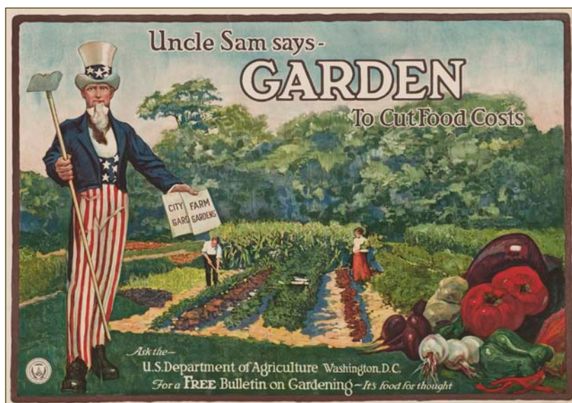
World War I poster, ca 1917

Because of preservation protocols, alternative original documents and artifacts will be offered for each venue