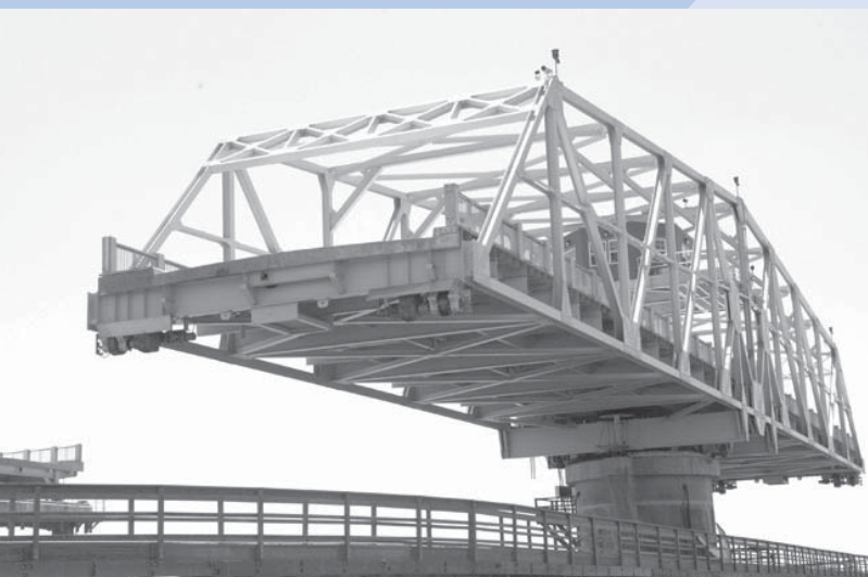
Highway professionals from around the country observed the results of accelerated bridge construction on a swing bridge in South Carolina.

Highways for LIFE project showcases gave highway professionals a first-hand look at accelerated bridge construction techniques in South Carolina and precast concrete pavement systems in California.