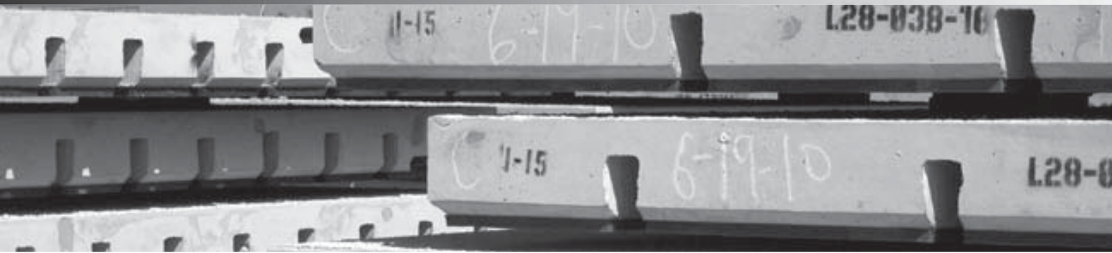
Completed precast slabs are ready for transport to the construction site.