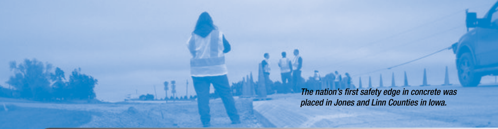
The nation's first safety edge in concrete was placed in Jones and Linn Counties in Iowa.