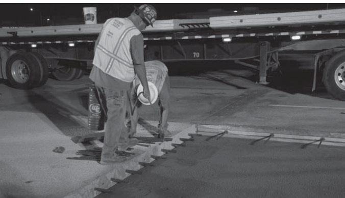
Showcase participants watched the nighttime placement of precast concrete pavement slabs in California.

The modular construction method was designed to enhance work zone safety by limiting motorists' exposure to temporary construction traffic control and workers' exposure to traffic hazards. Fabricating, assembling and inspecting the swing span in a controlled environment is expected to improve the bridge's quality.