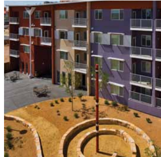
The building's courtyard incorporates art from local Native American artists.

fuel that would have been needed to transport the waste. More than 85 percent of the construction refuse was recycled. The apartments boast blown-in cellulose insulation, ENERGY STAR appliances, energy-efficient glazed windows, and insulated water pipes, making the apartments 40 percent more efficient than conventionally built counterparts. A central 15,000-square-foot courtyard has provided a playground, picnic space, native landscaping, and artwork. The downtown location and the transportation options further reduce the residents' energy footprint — and costs — by making driving optional, as evidenced by frequently full bicycle racks.