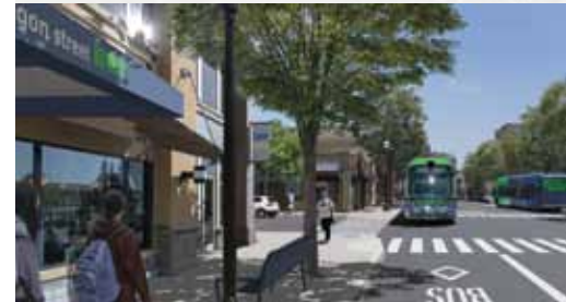
A rendering of the future Oregon Street BRT line.