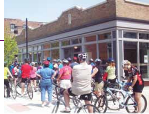
Residents enjoy a guided bicycle tour around Old North.

Old North has used complementary, forward-looking strategies that encourage a mix of land uses, promote walking, rehabilitate vacant buildings, support varied housing choices, and establish green spaces. The revitalization shows the success of a grassroots effort to reinvigorate a struggling neighborhood by investing in its people and respecting its historic character.