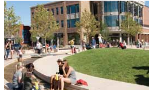
The roundabout creates a pedestrian-friendly environment and invites people to enjoy the space.