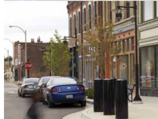
After 33 years as a pedestrian mall, two neighborhood blocks were reopened to vehicular traffic yet remain pedestrian-friendly.