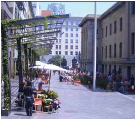
Mint Plaza, San Francisco, winner of the 2010 Civic Places category.

San Francisco, CA: Photo courtesy of Martin Building Company.