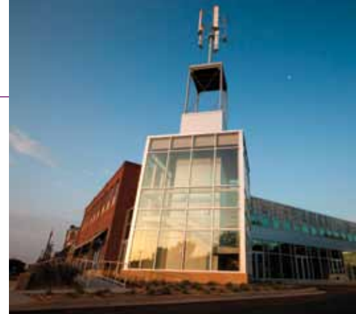
Maroney Commons is located downtown and blends into the streetscape.

Maroney Commons serves as a model for other rural towns looking to create vibrant community places that strengthen Main Streets, help residents learn new skills to compete in the 21st-century economy, and demonstrate environmentally responsible, energy-efficient design. Its message that “Rural is a good investment!” can inspire other towns around the nation.