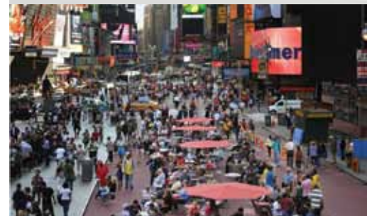
The redesigned Times Square includes new pedestrian areas as a result of the Green Lights for Midtown project, a major initiative in the city's efforts to improve mobility and safety, which was implemented in April 2009.