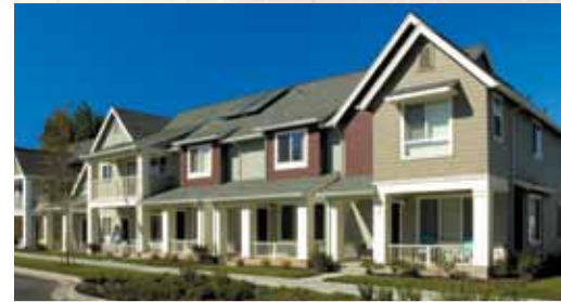
New Columbia's green street design, including 100 pocket swales, helps reduce stormwater runoff.