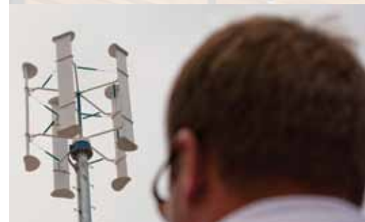
Maroney Commons will become a national training center for wind energy technicians.