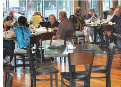
The restaurant reuses the floor from a basketball court and incorporates the bleachers in the ceiling.