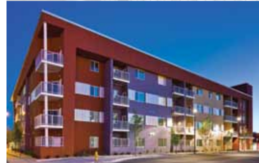
Silver Gardens is an ENERGY STAR Multifamily Pilot. Rainwater collected in an underground cistern irrigates the landscaping, and rooftop solar panels and a wind turbine provide electricity.