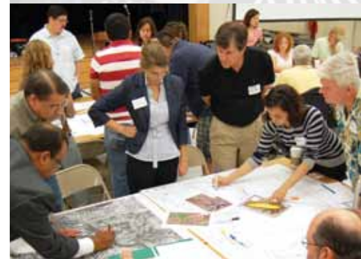
Plan El Paso 2010 engaged the public to provide detailed input during hands-on workshops on the design of their neighborhoods and the vision for the city’s future growth.