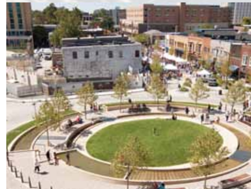
The roundabout makes the area safer for pedestrians and motorists by encouraging a constant, but lower, speed.