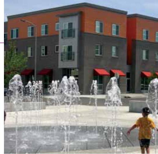
New Columbia provides a range of housing opportunities for residents of various incomes.

These approaches, like those of other award winners, improve the quality of life for residents, create vibrant places that draw private-sector investments and jobs, and make it easier for people to stay healthy by being active — all while helping to protect our land, air, and water.