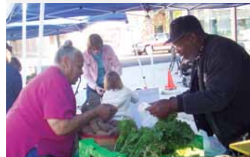
The North City Farmers' Market, launched in 2007, provides free health screenings and healthy cooking demonstrations.