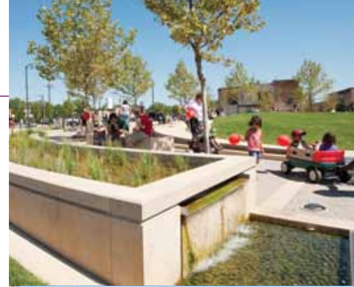
Plants filter the roundabout’s stormwater and beautify the water feature.

Normal’s multi-use roundabout is an innovative project that turned what could have been an ordinary intersection into a true amenity for the community. With a little creativity, Normal found a way to reap lasting economic, environmental, transportation, and civic benefits from its investment.