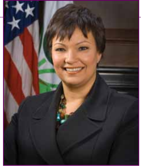
Lisa P. Jackson Administrator U.S. Environmental Protection Agency

The EPA is proud to share the stories and ideas from these projects so that other communities can learn from — and build upon — these successes. Please join me in celebrating the achievements of this year's winners.