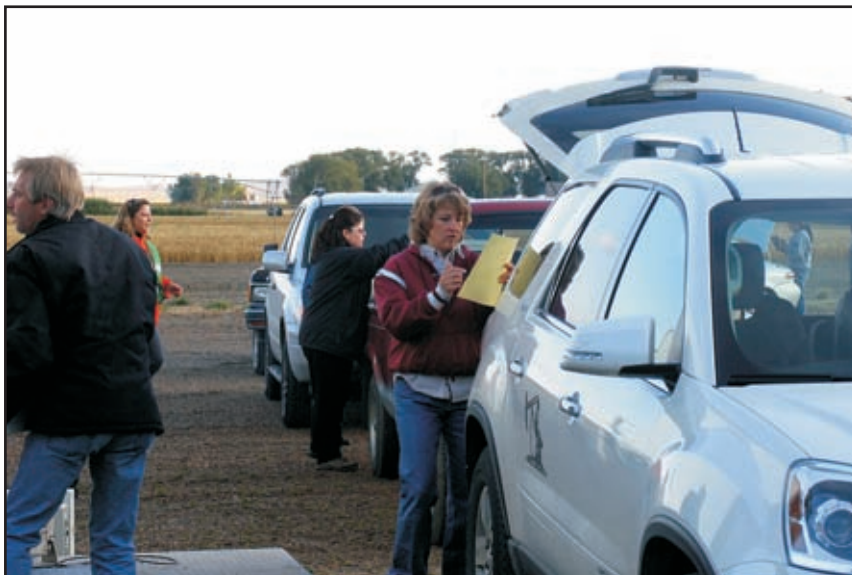
Volunteers hard at work.

...and ends with a full truck! Another was added to manage the 21,000+ lbs. collected at the weekend event, which combined with the August solid waste and school collections totaled a whopping 23 tons (46,040 lbs)!