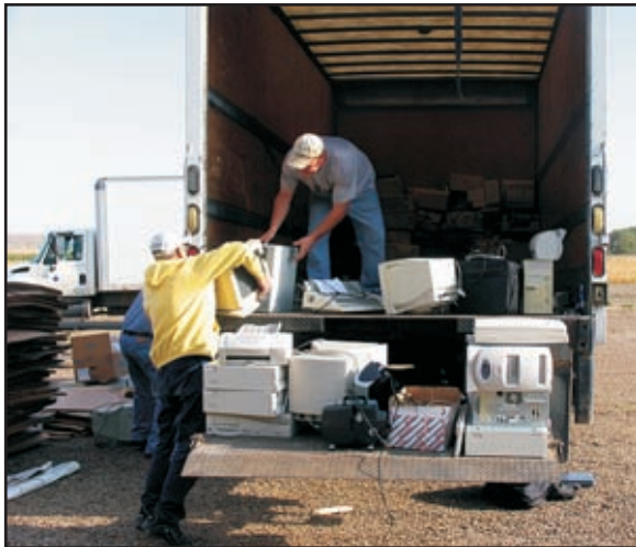
The loading begins...