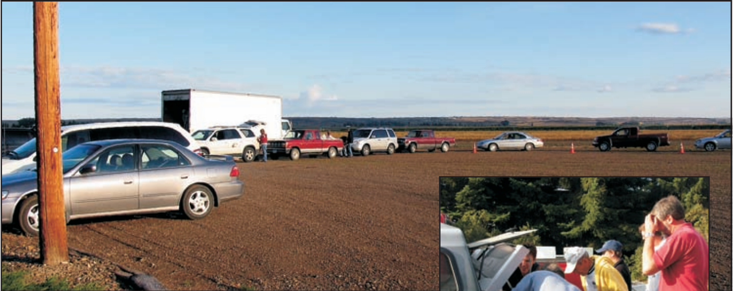
Early morning line-up Friday (above). Volunteers help to unload a vehicle (right).