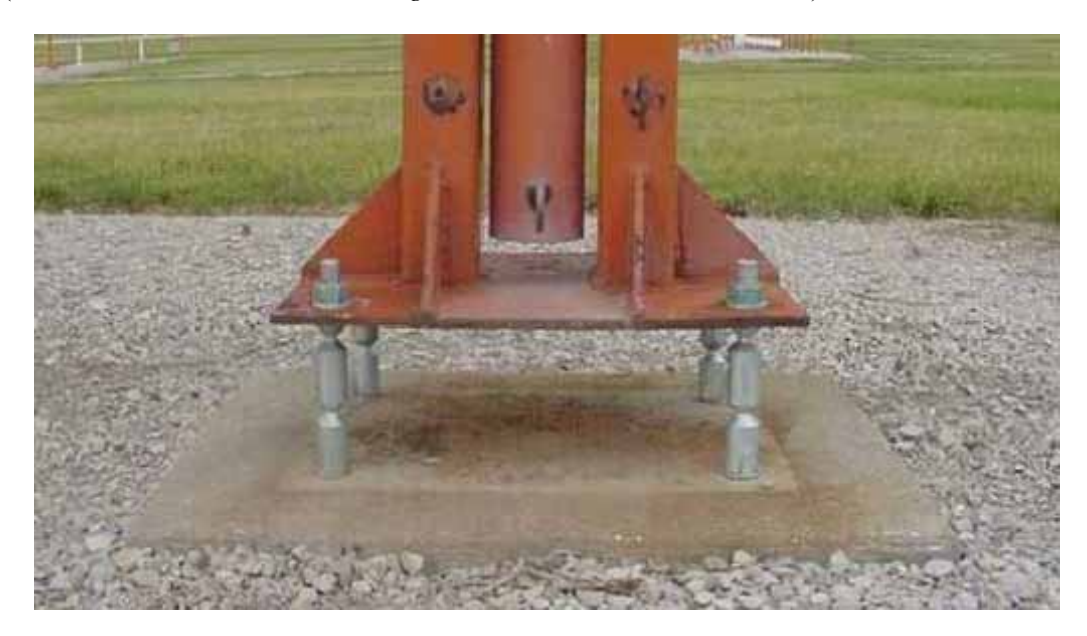
Figure 1. Application of Fuse Bolts

a. Failure of this type of connection is induced by providing a "stress raiser," due to removal of material from the bolt shank. One method used to achieve this is to machine a groove to reduce the bolt diameter or to machine flats in the sides of the bolts, making it weaker in a specific direction. Shear strength is maintained and tensile strength is reduced by machining a hole through the bolt diameter and locating it out of the shear plane. Fuse bolts must be carefully installed to ensure they are not damaged or overstressed when tightened. One disadvantage of fuse bolts is that the stress raiser may shorten the fatigue life of the bolt or may propagate under service loads and fail prematurely. Fuse bolts with machine grooves are commercially available. See Figure 1 as an example of the application of such fuse bolts. (Reference ICAO Aerodrome Design Manual , Part 6, Section 4.5.2.a)