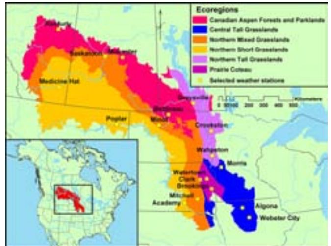
Figure 1. Location of the Prairie Pothole Region and its ecoregions in North America.

Model simulations determined that a warmer climate of only a few degrees Centigrade increased evaporation, shortened wetland hydroperiod, increased drought frequency and duration, and produced less favorable vegetation conditions in semi-permanent wetlands for most of the PPR compared to historic conditions. Unfavorable wetland conditions developed more often in the historically drier western portions of the PPR under a simulated warmer climate.