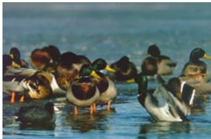
Mallard ducks ( Anas platyrhynchos ).