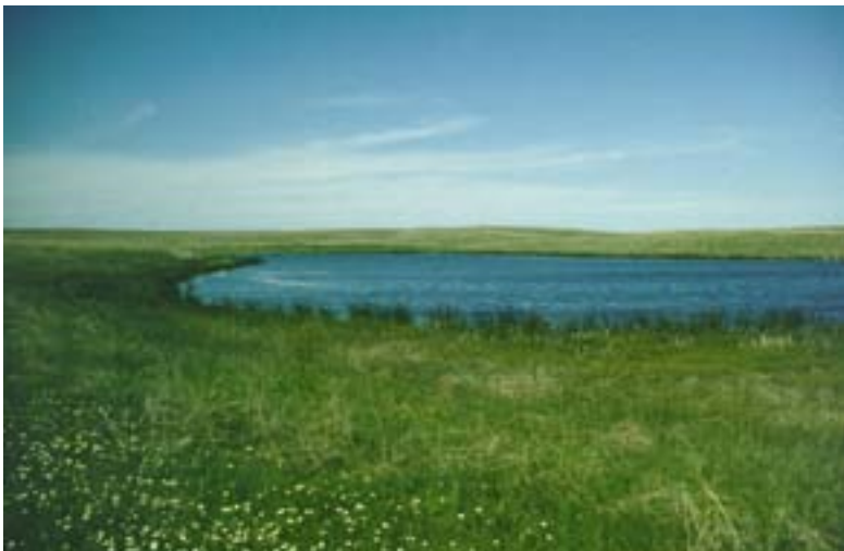
Prairie wetland in north-central South Dakota

Climatologists forecast increased drought in the PPR under most climate scenarios. Air temperatures in northern and central parts of the PPR may warm 3-6°C by the end of this century. Longer growing seasons, milder winters, earlier springs, and warmer and drier summers are expected.