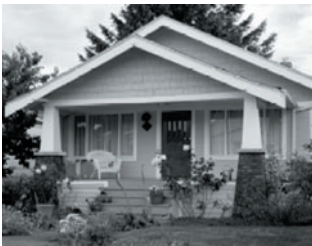
The Fair Housing Act prohibits discrimination in the extension of housing credit.

Each Federal Reserve Bank develops specific products and services to meet the informational needs of its region. The community affairs offices issue a wide array of publications, sponsor a variety of public forums, and provide technical information on community and economic development and on fair and equal access to credit and other banking services.