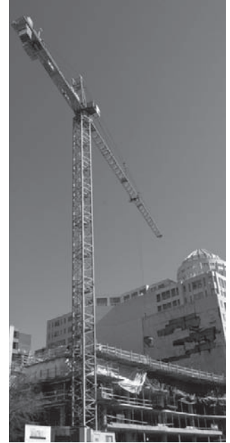
The Community Reinvestment Act encourages financial institutions to help meet the credit needs of their entire communities.