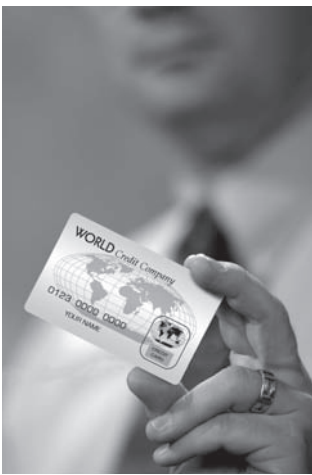
The Fair Credit and Charge Card Disclosure Act requires that applications for credit cards contain information about key terms of the account.