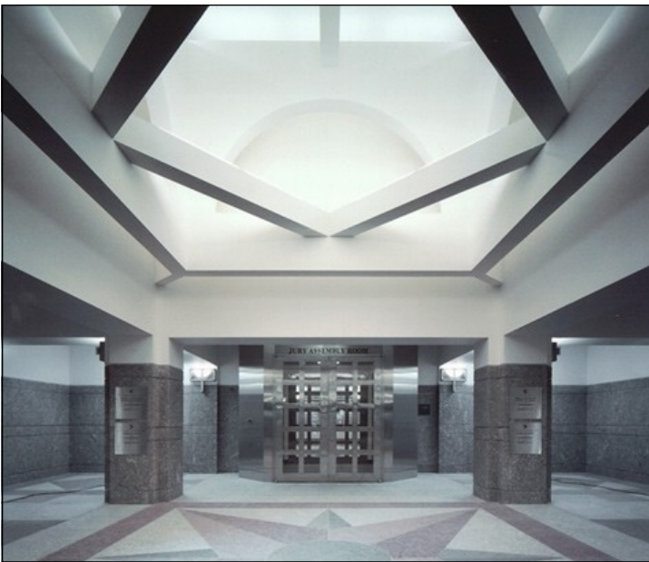
The Rudman Courthouse Vestibule