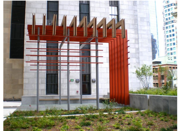
Part of the Green Roof

As of April of 2009 a total of 149.5 tonnage of construction debris was recycled and diverted from landfills, bringing the percentage of material recycled to 84.93%. This includes 6.17 tons of concrete, 8.59 tons of metal, and 19.26 tons of wood. Some of the main energy-efficiency components of the design include variable-speed drives for fans and pumps, motion sensors and daylight dimming for lighting, and new insulated double-pane, low-e win-dows. New plumbing fixtures reduce estimated water consumption by 642,000 gallons per year, which is 32% over code requirements. The indoor air quality of the building was improved through use of low-emitting construction materials such as paint, carpeting, and composite wood.