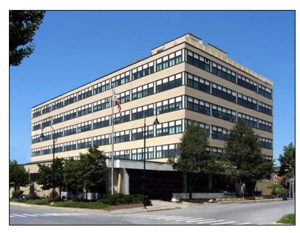
Burlington Federal Building, Post Office, and Courthouse

ATM: There are several banks behind The Church Street Marketplace.