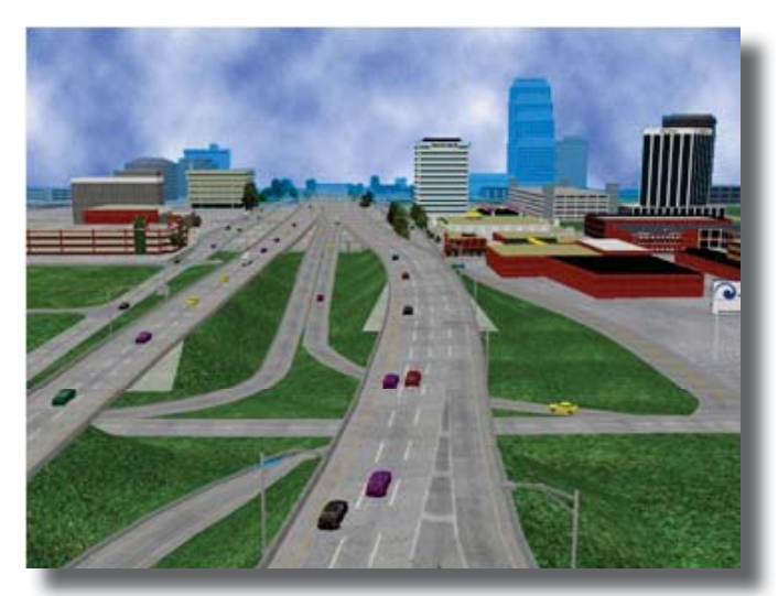
Traffic Simulation Model

Tremendous advancements in simulation technology have brought about new capabilities in modeling transportation systems and land use planning. Current traffic simulation models are able to model multimodal systems/events in a large area. A parallel advance in visualization systems, capable of operating on ubiquitous personal computers, makes possible