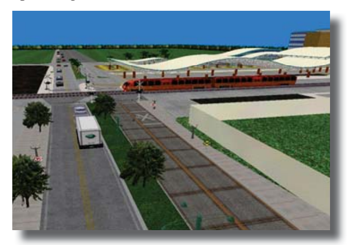
Traffic Simulation Model

There are two ways to show the behavior of the traffic in the real world surroundings (3D). The first way is to import the output from traffic simulation software (VISSIM, Paramics, WATSim, etc) to 3D modeling software (Studio Max, Maya, etc) and show the animation in non-real time. The second way is to import 3D models from 3D modeling software to traffic simulation software and show the simulation in real time. The University of Central Florida-Center for Advanced Transportation Systems Simulation (UCF-CATSS) has developed a high fidelity 3-D simulation and visualization of traffic flow along the I-4 corridor and the proposed Central Florida Commuter Rail System. The system effectively immerses the users through virtual, real world viewpoints (i.e., traffic camera, helicopter, driver, pedestrian) thus allowing the users to view the I-4 corridor and proposed train stations through various perspectives in a very rich virtual environment that contains high-fidelity terrain and structures representative of the metropolitan area of Orlando, Florida