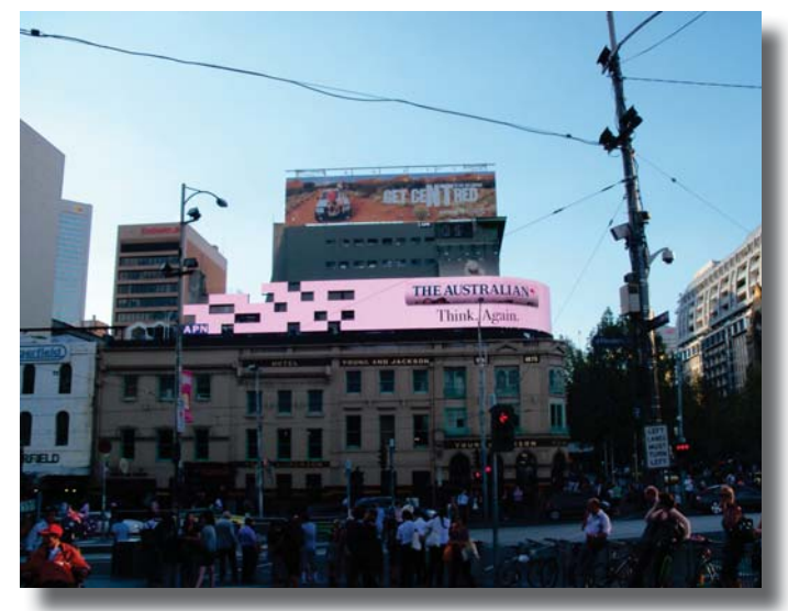
SCAN participants on tour

outdoor advertising technologies that have been approved, advertising permitted within the right-ofway, examples of signs both in and out of compliance with regulations and permits, extent of control of vegetation, and advertising at facilities such as toll booths, overpasses, sculptures, landscapes, rest areas, and intelligent transportation system facilities. There will be a presentation about the Scan at the NAHBA meeting in August in Madison, WI. For our