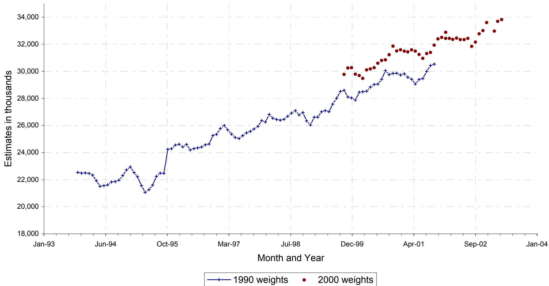
Figure 1. Foreign Born in the United States: Current Population Survey January 1994 - June 2003 Monthly estimates shown with 1990 and 2000 weights (in thousands)

Source: U.S. Census Bureau Internet Release date: October 29, 2003