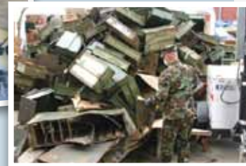
Assessment & Repair of Damaged Records following Hurricane Katrina