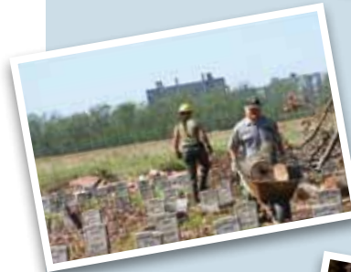
Debris removal from Chalmette National Cemetery. (Jean Lafitte NHP, NPS)