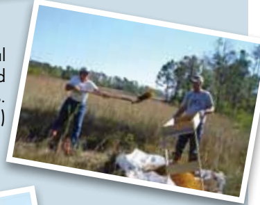
Archaeological survey of proposed housing sites.