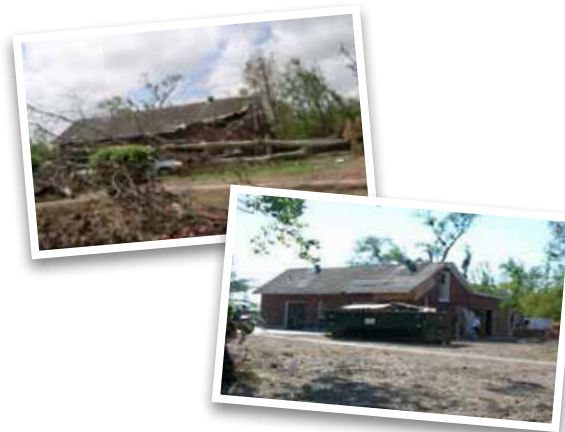
Historic carriage house damaged by Hurricane Katrina before and after stabilization, Chalmette, LA.