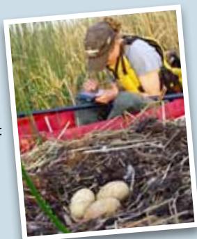
Biological Survey of swan nesting sites. (Yukon Flats NWR, FWS)