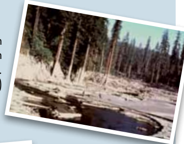
Stream & riparian damage from Mt. St. Helen's eruption.