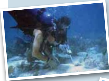
Coral reef restoration (FWS)