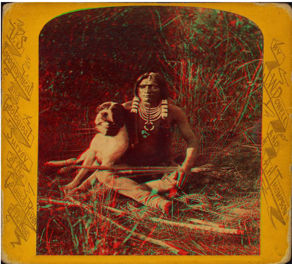
"Indian Boy and his Dog." (2nd version) Indians of the Colorado Valley Series. No. 100. "U-IN-TA UTES. Living in the U-in-ta Valley, on the Western Slope of the Wasatch Mountains, in Utah." U.S. Topographical and Geological Survey of the Colorado River of the West. By J.W. Powell and H.H. Thompson. Photographed by John K. Hillers. Library of Congress, Photo Archive image ID 1s01639v.jpg

The USGS, in cooperation with the Library of Congress has a new publically available Native American history website containing information and 3-D images from the geological and geographical surveys west to the 100th Meridian in the early 1870s, including John Wesley Powell's Colorado River surveys. These surveys collected facts related to the area's topography and mineral resources, resident Native Americans, and settlement and economic development. The website uses the Library of Congress' original stereo photographs of southwestern Native Americans from 1871-1875 featuring historic images of the Apache, Mohave, Navajo, Paiute, Ute, Zuni, and other southwestern bands and tribes along the Colorado River. Additionally, take a virtual hike or raft trip to the bottom of the Grand Canyon or visit in 3-D the geology of our National Parks. For more information, visit http://3dparks.wr.usgs.gov/indians .