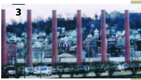
Smokestacks and housing (background) in Homestead, Pennsylvania.

New legislation, grant programs, and innovative market-based initiatives at the state and federal levels are helping communities to transform brownfield sites into vibrant, mixed-use neighborhoods throughout the Fourth Federal Reserve District.