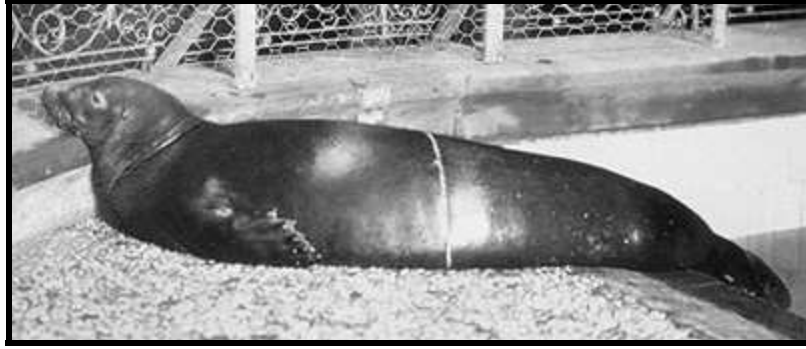
Figure 1. A 1910 photograph of Caribbean monk seal at the New York Aquarium. Specimen captured in Campeche Bank region as described in Townsend (1909).

Caribbean monk seal vocalizations have been described as roaring, pig-like snorting, moaning, dog-like barks, growls, and snarls (Gosse 1851, Hill 1843, Nesbitt 1836, Townsend 1909). Pup vocalizations have been reported as a long, drawn out, guttural “ah” with a series of vocal hitches during enunciation (Ward 1887). Underwater vocalizations of Caribbean monk seals have not been described and are unknown. As with both Hawaiian and Mediterranean monk seals, Caribbean monk seals apparently became sensitized to human presence after exposure to hunting or other abusive treatment. Thus, although many recent descriptions of monk seals state that they are highly sensitive to human disturbance, some accounts, including early accounts of the species (e.g., E.W. Nelson, as cited in Adam and Garcia 2003), describe them as being very approachable when hauled out on beaches.