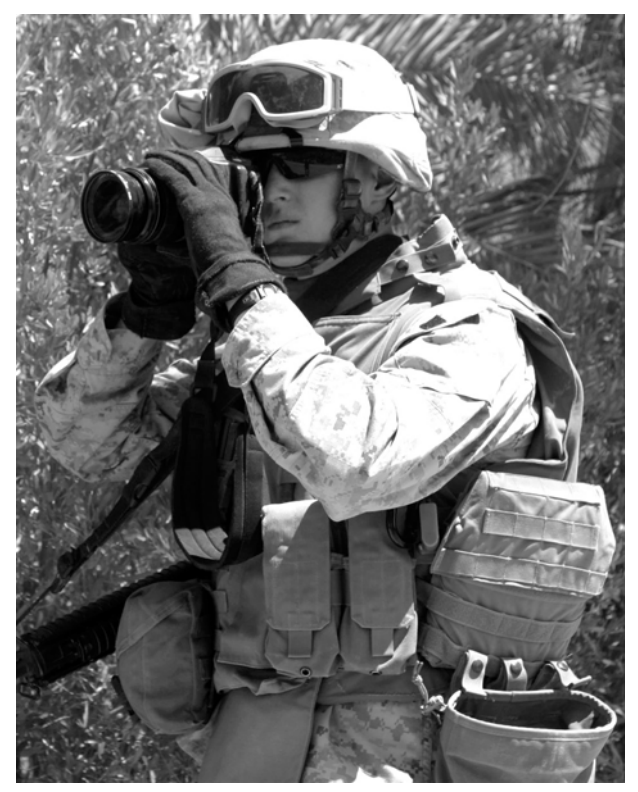
Figure 1-1. Still Photographic Imagery.