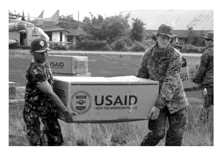
Figure 4-3. Foreign Humanitarian Assistance and Disaster Relief.

Many factors are unique to counterdrug operations, such as a high degree of interagency and international coordination. Most significantly, the legal and law enforcement aspects are extremely sensitive. Commanders use COMCAM imagery to familiarize their Marines with terrain features, show facilities for use in planning command posts, document seizures and evidence, and protect US forces from legal reprisal.