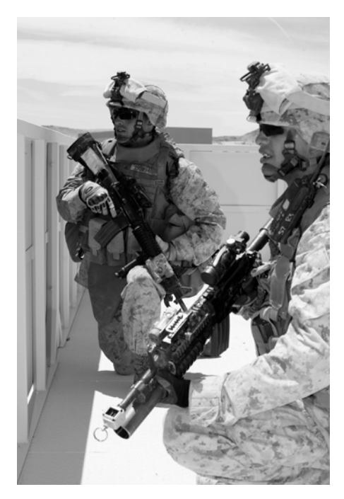
Figure 4-6. Training.