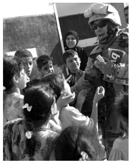
Figure 4-2. Civil-Military Operations.

Combat camera can be attached to the civil engineer battalion to document conditions before and after civil engineer battalion