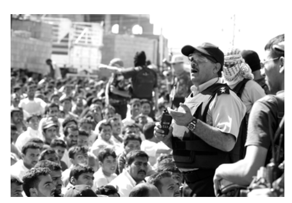
Figure 4-4. Peacekeeping Operations.

One of the five pillars of IO is PSYOP. Combat camera is an invaluable resource to support efforts to shape the battlefield and execute a PSYOP campaign plan. Psychological operations are planned operations that convey selected information and indicators to foreign audiences to influence their emotions; motives; objective reasoning; and, ultimately, the behavior of foreign governments, organizations, groups, and individuals. A