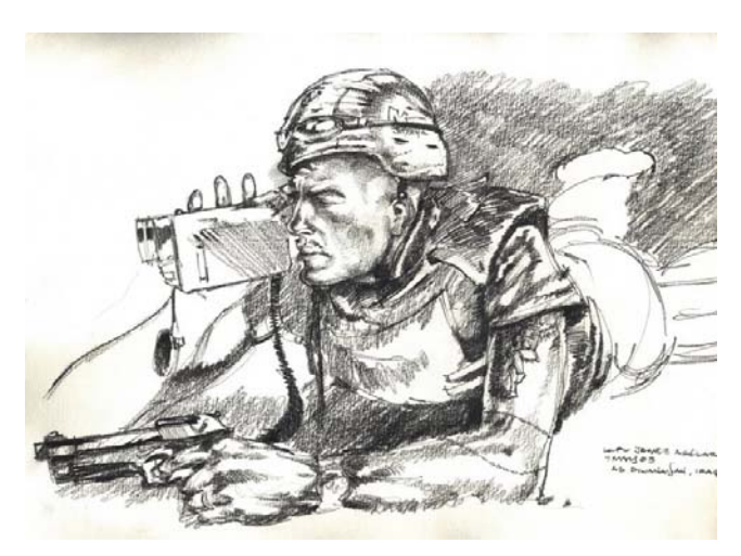
Figure 1-4. Combat Art.