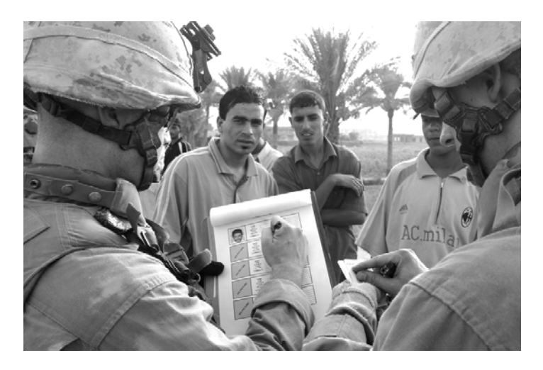
Figure 4-1. Information Operations.