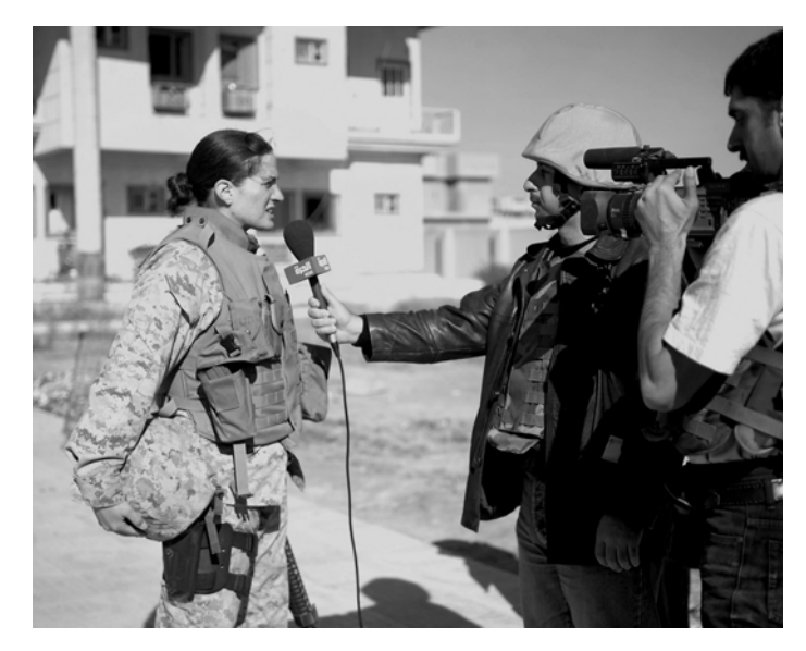
Figure 4-5. Public Affairs.