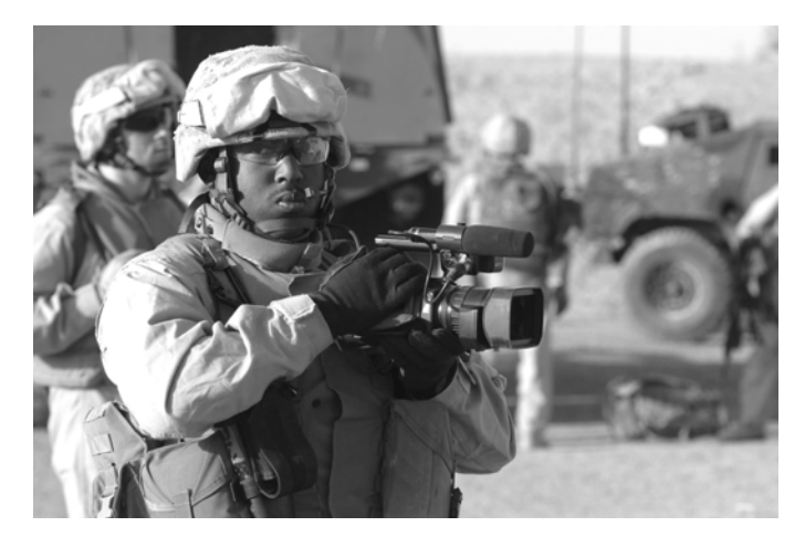
Figure 1-2. Motion Imagery (Video).