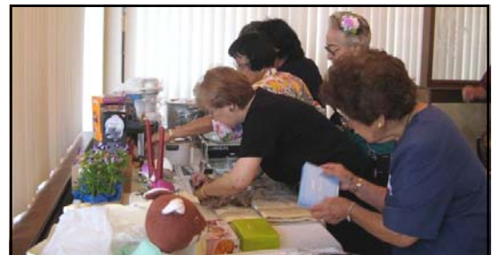
Pricing the auction items

Aloha Chapter —The largest group in many years gathered on Sunday, April 6 for the Aloha Chapter’s Spring Luncheon at the Kaneohe Marine Corps Station Officer’s Club. This was a change from our usual venue and a turnout of 42 members and guests gathered for the GORGEOUS VIEW overlooking the club’s golf course and the beautiful Pacific Ocean. It was all complimented by a wonderful brunch, WONDERFUL FRIENDS, and great camaraderie. The group unanimously voted to return!! A VERY SUCCESSFUL combination Plant Sale/Bake Sale and Silent Auction was held before, during, and after the brunch to “fatten” the club’s coffers. The Club’s summer luncheon will be held in August – date to be determined.