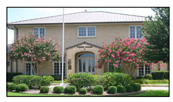
One of the three Fisher Houses at Lackland.

"Dedicated to our greatest national treasure ... our military service men and women and their loved ones."