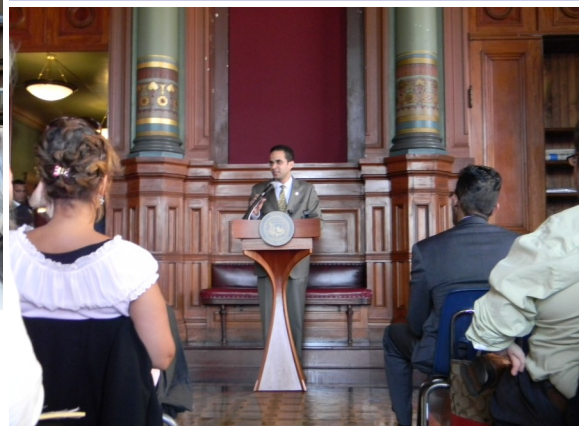
City of Providence Mayor Angel Taveras welcomes attendees to HUD's Fair Housing Month event at City Hall in Providence, RI.

Join HUD New England on Twitter to stay up to date on news and information in Connecticut, Maine, Massachusetts, New Hampshire, Rhode Island and Vermont. To sign up go to http://twitter.com/HUDNewEngland