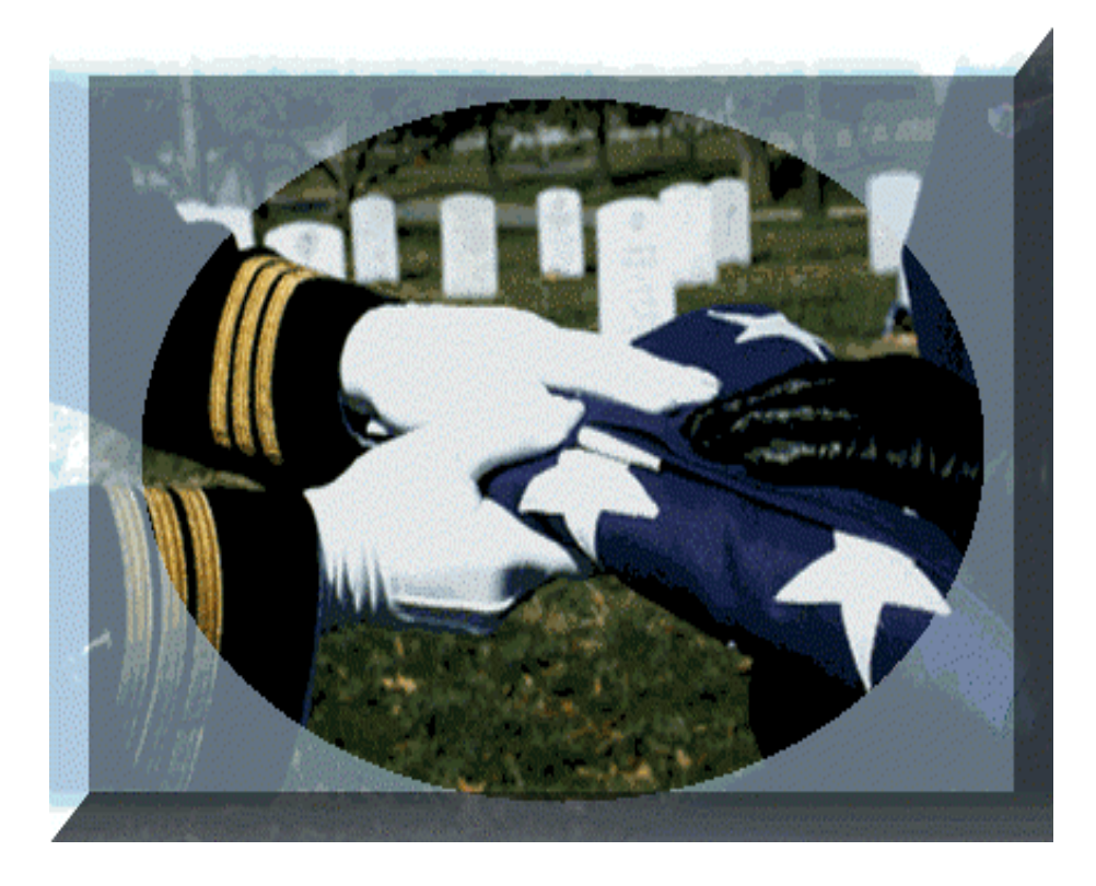
BUREAU OF NAVAL PERSONNEL