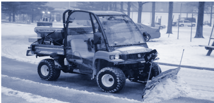
PPPL used B20 biodiesel in the "Bio-Gator" vehicle for the first time.

The DEPARTMENT OF ENERGY'S PRINCETON UNIVERSITY PLASMA PHYSICS LABORATORY (PPPL) first began using B20 biodiesel as an alternative fuel in FY 2007 for new utility vehicles and existing diesel-powered fleet vehicles. The organization used B20 fuel for the first time ever in a new utility vehicle—the John Deere Gator—a groundbreaking effort. PPPL also reinstated the use of natural gas powered vehicles. These efforts, along with managing vehicle use, allowed PPPL to reduce petroleum fuel from more than 7,200 gallons in the FY 2005 base year to just over 4,600 gallons in FY 2007. This reduction of 36 percent is nearly double EISA's 2015 goal of 20 percent. The use of B20 also resulted in a reduced carbon footprint of more than 2,400 pounds of carbon dioxide.