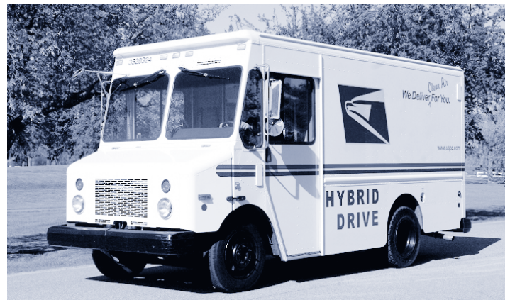
USPS Hybrid Electric Vehicle

Hybrid Electric — USPS is currently conducting tests on medium duty hybrid electric step vans from Eaton Corporation and Azure Dynamics. There are 10 Hybrid-Electric Ford Escape vehicles already in the fleet.