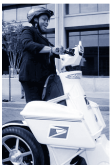
T-3 Three-wheel Electric Vehicle

Fuel Cell — Fuel-cell technology promises the benefits of no greenhouse gasses, no air pollutants, greater energy efficiency, and reduced reliance on foreign oil. By serving as a test bed for this technology, the Postal Service is working to advance the use of fuel-cell vehicles. An example is the existing fourth generation hydrogen fuel cell Chevrolet Equinox partnership with General Motors, with funding support from the U.S. Department of Energy. A hydrogen fuel cell Equinox has been delivering mail at the Irvine, California, Post Office since July