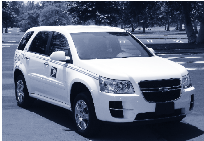
USPS Equinox Fuel Cell Vehicle

For more information, please contact David West at david.e.west@usps.gov or 202-268-6871.