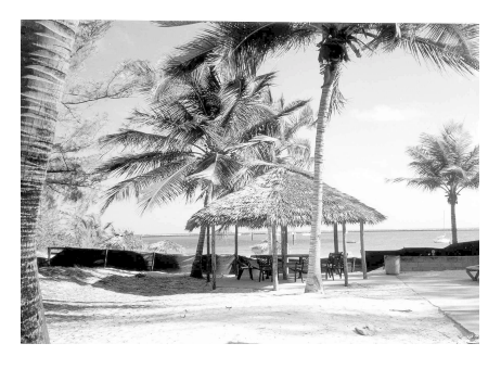
Due to the amount of sun that beats onto the AUTEC base, one of the primary concerns for the base was shading, which is provided by this gazebo.

AUTEC Recreation Association (ARA) solicited suggestions from the basewide population and the