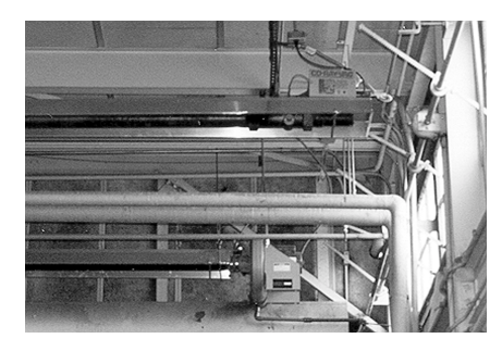
Infrared heating efficiently heats buildings and people the same as the sun heats the earth.

Fort Knox has incorporated a thermostat that uses an adjustable photoelectric eye to lower the thermostat setting to 55 degrees whenever the lights are turned down, or at night. This thermostat has removed the headaches of having to reset timers or clocks