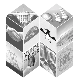
FEMP is Your Partner in Making Projects Happen