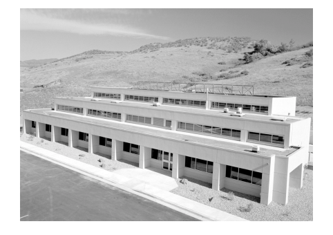
The Thermal Test Facility is an energyefficient, state-of-the-art laboratory in which NREL researchers and their Federal and private-sector partners can investigate and develop advanced building components and systems.

The energy-efficient, integrated building design was a collaborative effort of engineers and designers in NREL's Center for