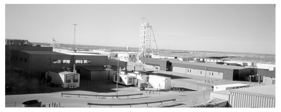
DOE's Waste Isolation Pilot Plant is located 26 miles east of Carlsbad, NM.

In an effort to meet its goals for energy and cost reduction, the WIPP site will retrofit a majority of its lighting, including the high bay areas. The high bay areas currently use high pressure sodium fixtures which are typically switched on (at the lighting panel) on Monday morning and switched off on Friday afternoon. They