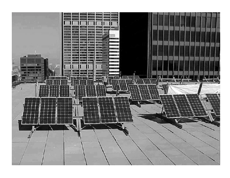
The Metcalfe solar energy project will reduce carbon dioxide emissions equal to the emissions produced from driving an average passenger car 25,117 miles, or once around the world.