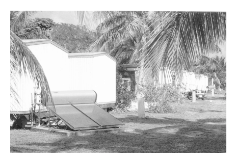
The second solar water heating system installed at AUTEC.

Cost is another selling factor. The last round of Club Cars cost about $5,500 for the two-seaters; fourseaters were another $1,000. Carts are easier and less expensive to maintain. They take up less space and require less technical knowledge for maintenance and repair. Carts have no oil or filters