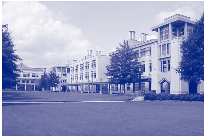
Duke University’s Levine Science Research Center in Durham, NC.

stormwater runoff for use in irrigation, and allow for easy future additions of building-integrated photovoltaics as an electricity source. Through these efforts, they hope to achieve a U.S. Green Building Council LEED™ Gold rating for this facility.