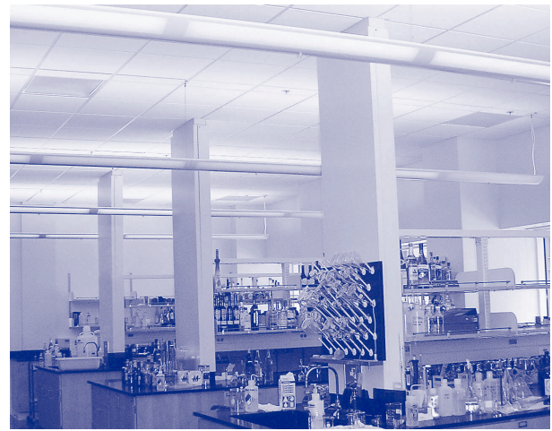
Alcohol Laboratory—National Laboratory Center; Bureau of Alcohol, Tobacco, Firearms and Explosives; Ammdendale, MD.