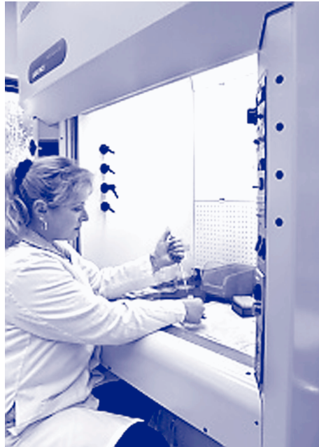
Prototype High Performance Berkeley Hood installed at the University of California, San Francisco.

Fume hoods are box-like structures often mounted at tabletop level with a movable window-like front called a sash. The devices capture, contain, and exhaust hazardous fumes created during industrial processes or laboratory experiments. Generally, fumes are drawn out of a hood by fans through a port at the top of the