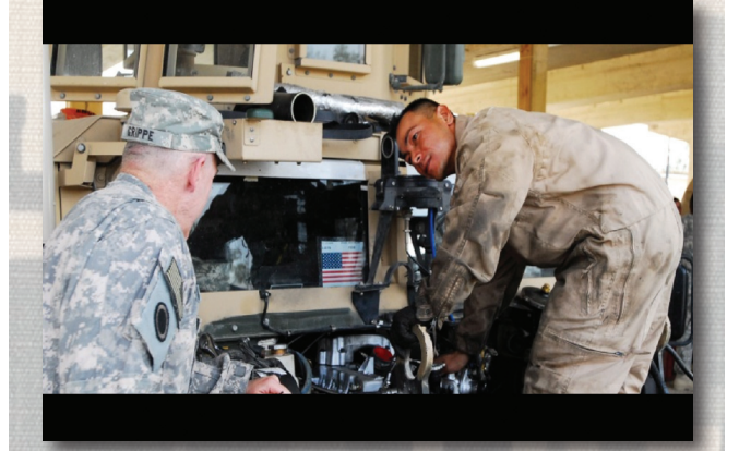
There is no greater source of talent – and you can have access to it for free!