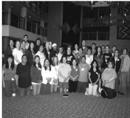
Pictured: 2007 PAK Teams & Partners

The PAK strategy includes: 1) create a 'package' of physical activities that are culturally appropriate to American Indian and Alaskan Native communities; 2) train interested Field Teams from across the Nation to implement and field test the PAK in their communities; 3) conduct the PAK Summit/Reunion to collect information regarding the modification, acceptability and usability of the PAK in their communities; and 4) develop a strategy to distribute and disseminate PAK to American Indian and Alaskan Native Communities across the United States.