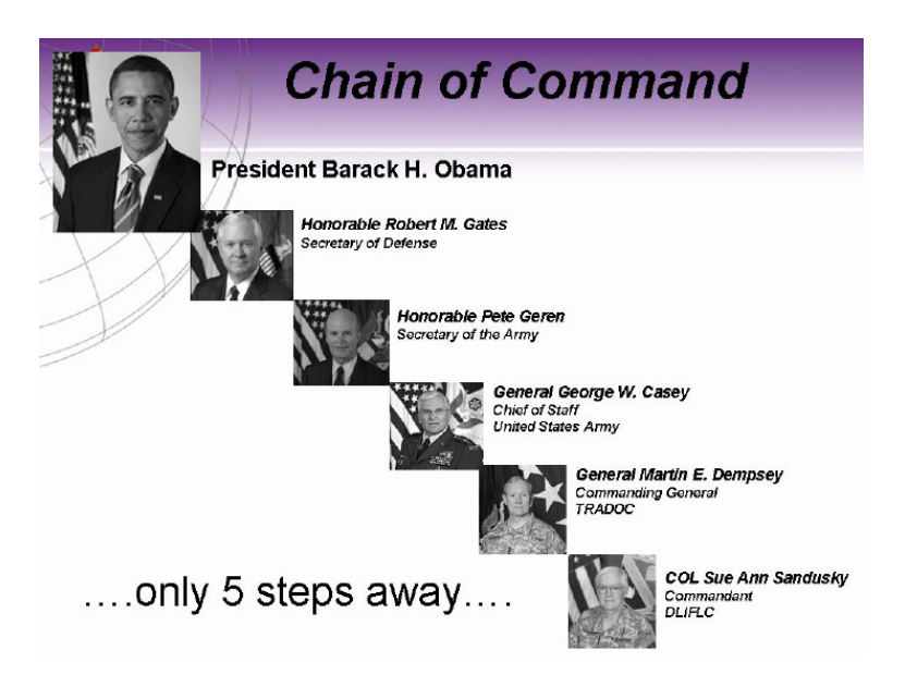
Figure 1. The DLIFLC Commandant Five Steps Away from the President

Defense Language Institute Foreign Language Center