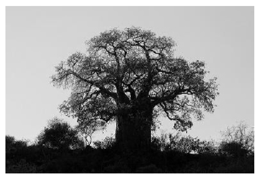
Figure 2. Wisdom is Like a Baobab: No Single Person Can Embrace It.

Now, many of you know that I have spent some time in Sub-Saharan Africa and that I like African proverbs. Here is one that I find particularly meaningful: "Wisdom is like a baobab—no single person can embrace it." I like this proverb because it reminds me that, as smart as I may be, I am not as smart as all of us collectively and that to make wise decisions as the leader of this great Institute, I need all of your contributions and the benefit of your ideas and experience. I am, of course, the commander, who is, in the end, responsible for all that happens. But being the commander of DLIFLC is not like being the commander of an Army brigade with 3,000 soldiers who are waiting to "salute and execute" once the colonel issues an order. No, the commander of DLIFLC must lead through a process of collaboration, cooperation, and coordination. And I recognize that to lead in this way, I need to make sure you all understand how I see things and the direction in which I am trying to take us.