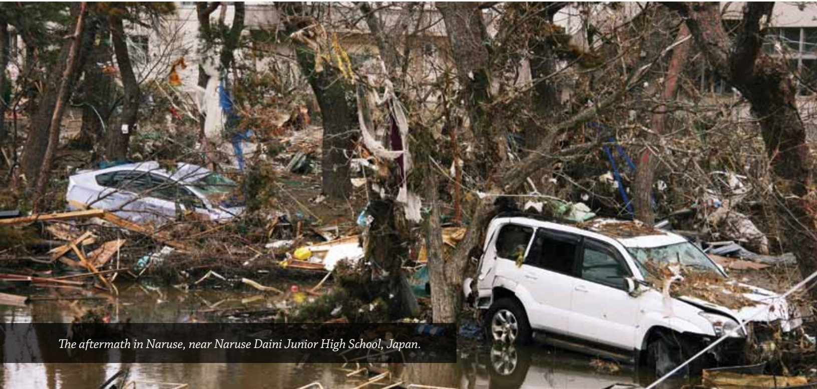
The aftermath in Naruse, near Naruse Daini Junior High School, Japan.

the population, that they'll see that we Americans, not just the U.S. armed services, but America in general, is truly a friend to Japan."