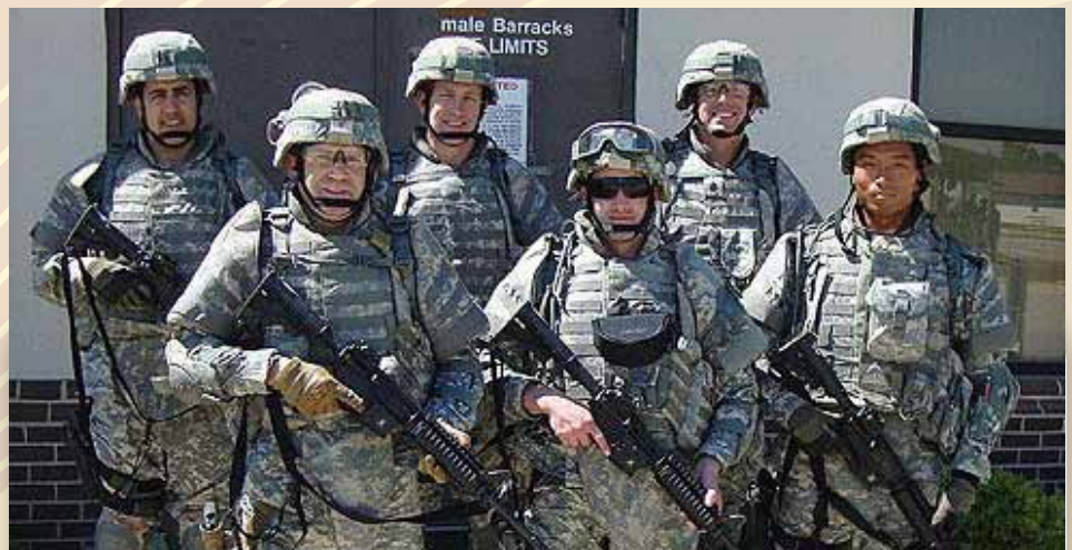
Participants of the Afghanistan Pakistan Hands program pose for a photo. The program trains military and civilian personnel from all services, mostly mid-career officers, to serve as a core cadre to build trust between the U.S. military and local populations in Afghanistan and Pakistan. Joining the program requires a 45-month commitment, including two deployments of 12 and 10 months respectively.

http://www.dcmilitary.com/stories/041411/waterline_28226.shtml Published April 14, 2011