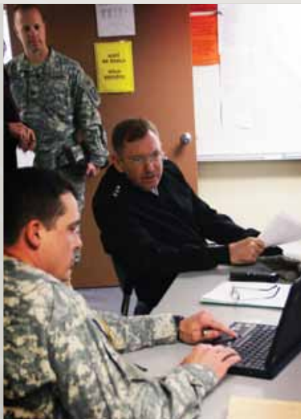
Lt. Gen. Kenneth P. Keen listens to a Spanish course language student explain the use of specialized language programs which allow for more rapid foreign language acquisition.