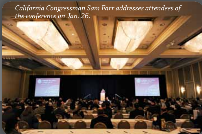
California Congressman Sam Farr addresses attendees of the conference on Jan. 26.