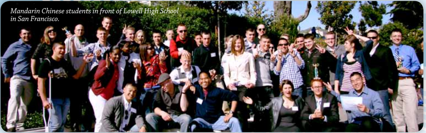
Mandarin Chinese students in front of Lowell High School in San Francisco.