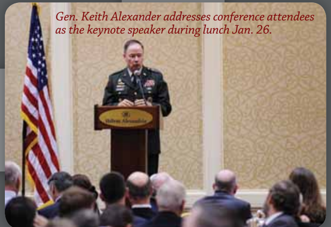
Gen. Keith Alexander addresses conference attendees as the keynote speaker during lunch Jan. 26.