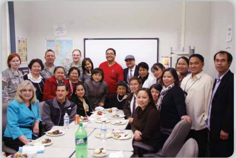
Staff and faculty from Asian School I enjoy traditional Tagalog cuisine.

"It was a most challenging period, because there were no other instructors except for one, me. There was no typewriter or phone to prepare the lessons or communicate with my direct supervisor in