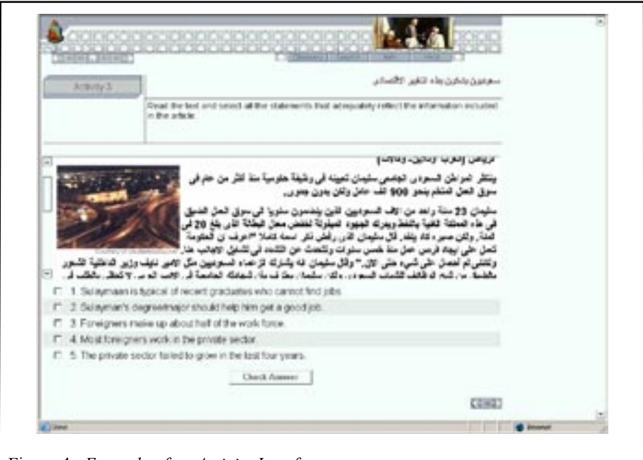
Figure 4. Example of an Activity Interface.

communication. This motivation works only if the learners link the activities with tasks in the real world.