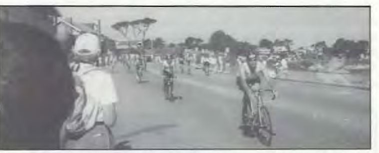
Bicyclists slow down near the Tinnery Restaurant in Pacific Grove before making the turn to begin another lap. Bicycling is the second event held during the Triathlon.