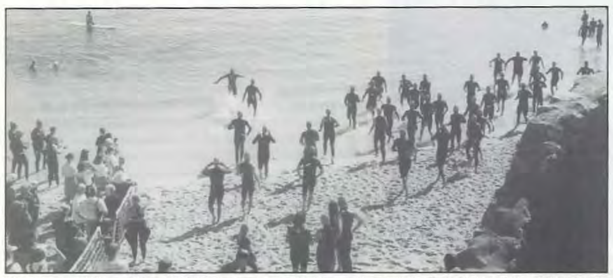
Spectators and competitors alike look on as a group of women prepare to begin their swim Sept. 12 during the Pacific Grove Triathlon.