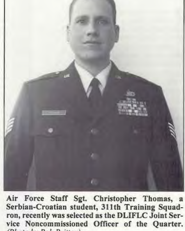
Serbian-Croatian student, 311th Training Squadvice Noncommissioned Officer of the Quarter.