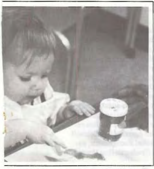
etoddlers' Room, brushes up on his artisinting class in the afternoon.