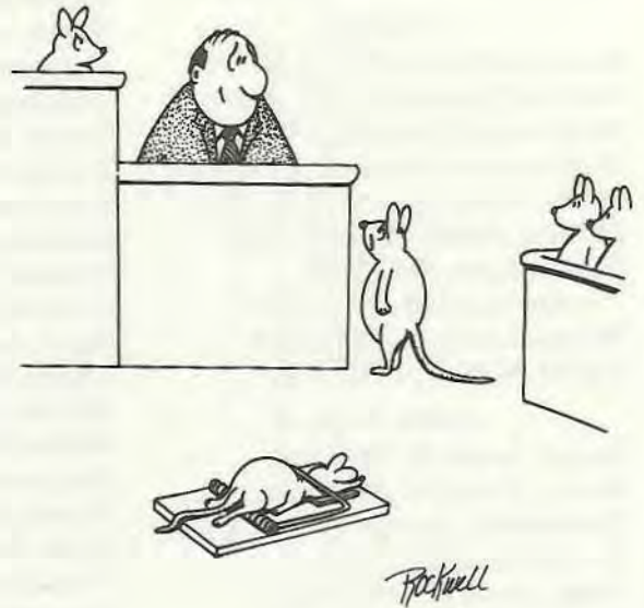
"Is that your defense? You were cleaning it and it just went off?!"