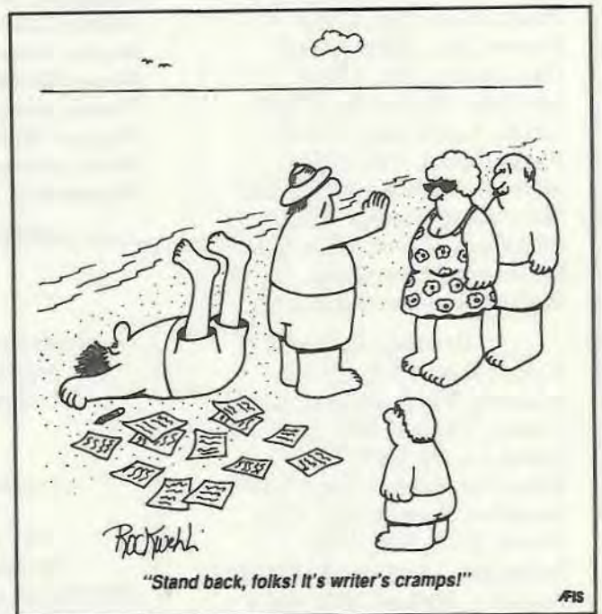
"Stand back, folks! It's writer's cramps!"