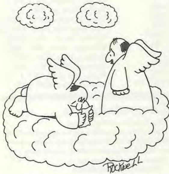
"Why, it's not a silver lining at all! It's plain old tin foil!"