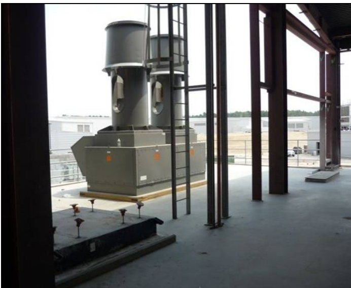
Figure 8. Beamline hutch central exhaust system fans in place at service building 5.

Proposal evaluations for the steel and lead hutches have been completed. Both contracts were awarded to Global Partners in Shielding, a small business located in Passaic, New Jersey. Seven solicitations were released to FedBizOps in the past four weeks. Most significant were RFPs for the damping wiggler vacuum chambers, the HXN beamline components, and the in-vacuum undulator. Awards should be made in September through early October.