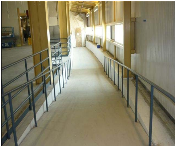
Figure 4. Bypass corridor ramp at pentant 2.

Construction of the ring building and LOBs made excellent progress during July and continues to remain ahead of schedule. Ring building pentant 2 (Fig. 4) was turned over to the project in July and beneficial occupancy of the injection building is scheduled for early August. LOB construction continues to gain momentum, as structural steel for three LOBs is now complete and exterior envelope and interior build-out is progressing rapidly. Favorable summer weather, drier than usual, has enabled high construction productivity for the period.