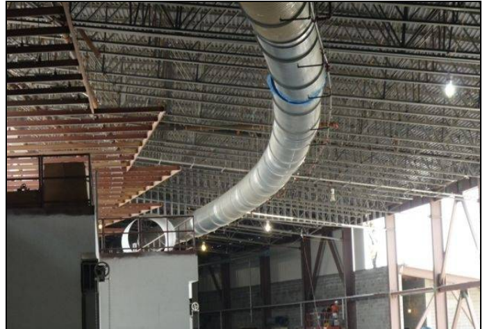
Figure 5. HVAC supply duct installed in pentant 5, the last to be completed.

during July, so the entire injection building will be turned over in early August instead of the two-phase approach previously planned. With August turnover of the injection building, nearly half the ring building space will have been completed sufficiently for ASD to accept occupancy and conduct installation activities. Limited contractor punchlist work remains in the occupied areas and is being coordinated under a work permit system.