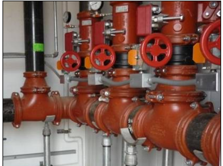
Figure 6. Fittings in the pentant 2 fire protection control room.

Work on the remaining sections of the ring building continues to progress well. The entire roof system will be completed in August and siding exterior panel installation is now underway in pentant 5. Completion of enclosure of the building is expected during September.