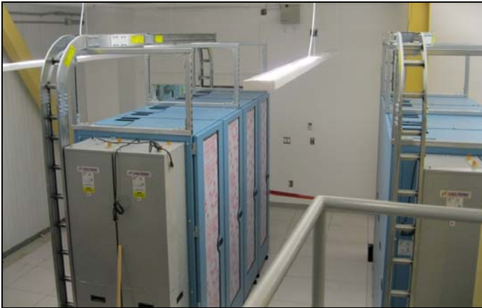
Figure 2. Equipment enclosures and cable trays in the computer room.

The AC distribution of the computer room needed to be redesigned. The final design requires the installation of two additional 30 KVA UPS units. The cable tray design for the computer room is finished; some parts are in house and others are awaiting delivery. The installation of the pentant 2 cable tray (Fig. 2) will be complete by the end of August.