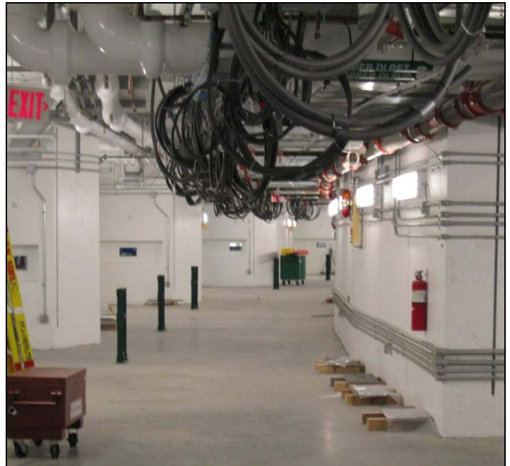
Figure 3. Completed DC cabling for magnets in the accelerator tunnel.

In the RF building and in the computer room, cable trays have been installed. Preparations for the transformer installation in the UPS room are completed.