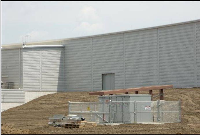
Figure 7. Topsoil finish-graded and being readied for seeding at pentant 2.

seeding of the entire site, has begun (Fig. 7), with the majority of this work planned for August and September.