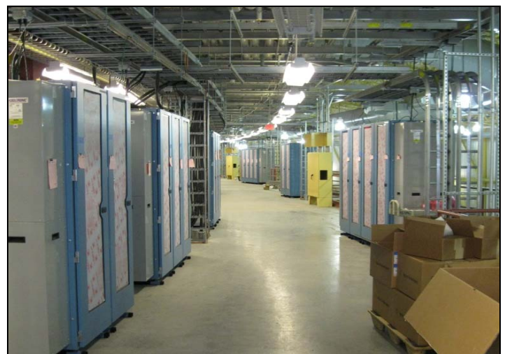
Figure 1. Pentant 1 mezzanine with equipment as far as the eye can see.

The second delivery of power converters has been received. The first units are being installed in racks in pentant 1 (Fig. 1). We now have the power converters for pentants 1 and 2 and the transport lines in-house. About 93% of all 575 equipment enclosures have been received. Rack deliveries should be complete by early August.