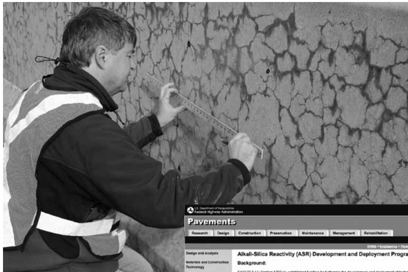
A highway worker uses a ruler to examine a concrete median barrier affected by alkali-silica reactivity (ASR). To learn more about ASR, visit www.fhwa.dot.gov/pavement/concrete/asr.cfm .

Designed for quick and easy access, the Reference Center features an introductory overview of ASR, as well as research reports, State specifications, and guidance documents. Also featured on the site are case studies from around the world, including field trial summaries that document ASR treatment methods and test results. Visitors can also find specifications and guidance from international agencies, such as the Canadian