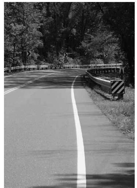
The All-Weather Pavement Marking System makes it easier for drivers to see markings on wet roads.