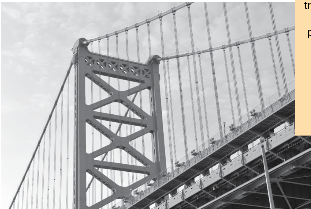
FHWA's new Bridge Construction Inspection course discusses an inspector's safety responsibilities and potential hazards that an inspector may encounter.