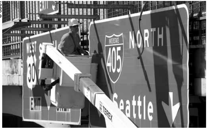
Highway safety assets can include signs, guardrails and traffic barriers, lighting, and traffic signals.

followed by group discussion and a question and answer session.