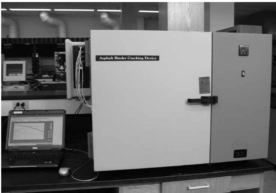
Innovations funded by FHWA's Technology Partnerships Program include the Asphalt Binder Cracking Device, which simulates pavement cracking to help agencies predict and prevent asphalt failure caused by cracking at low temperatures.