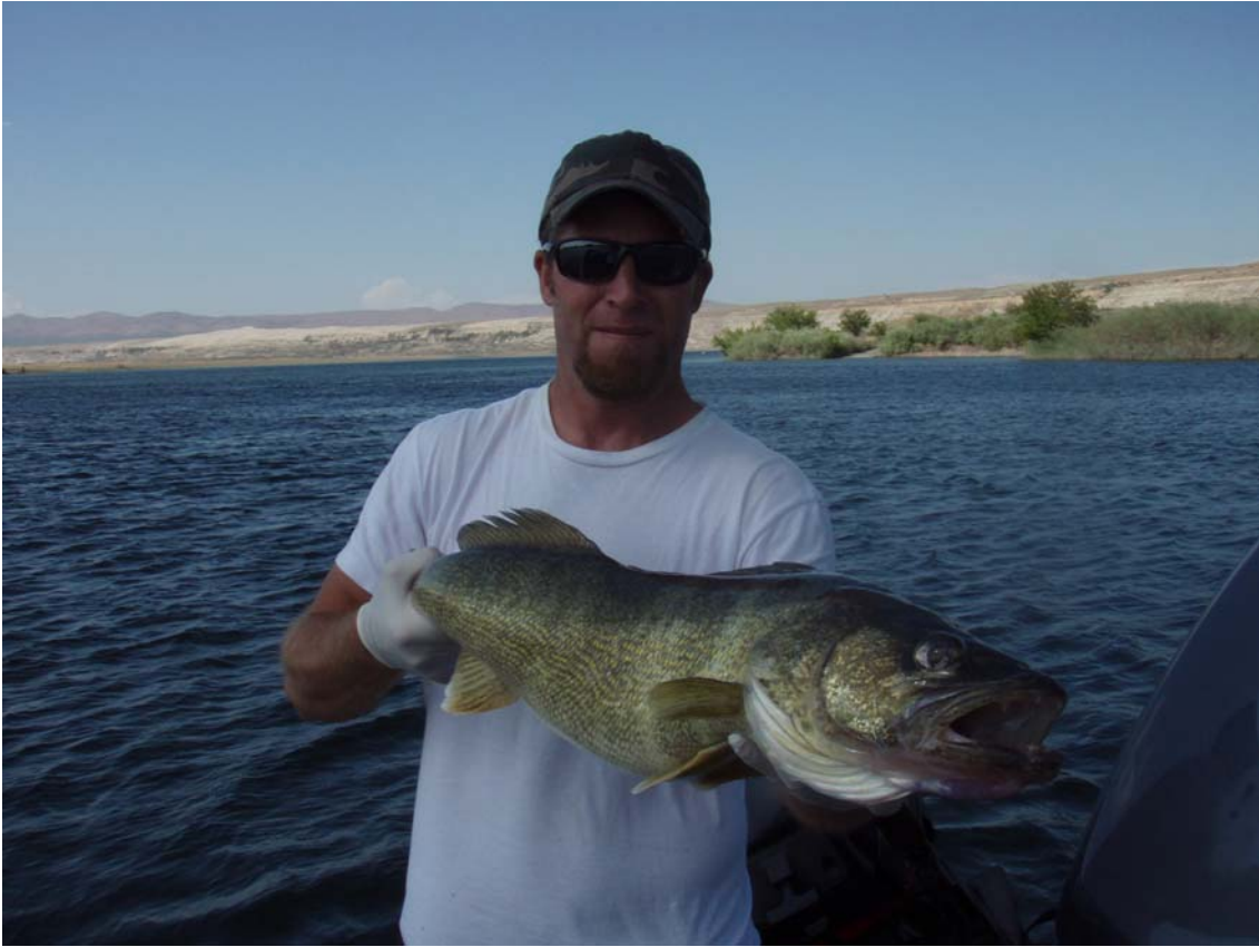
A bass caught up by Priest Rapids Dam