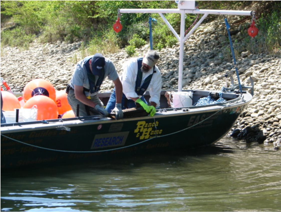
A string of fish caught in the 100 Areas on 7-17-09