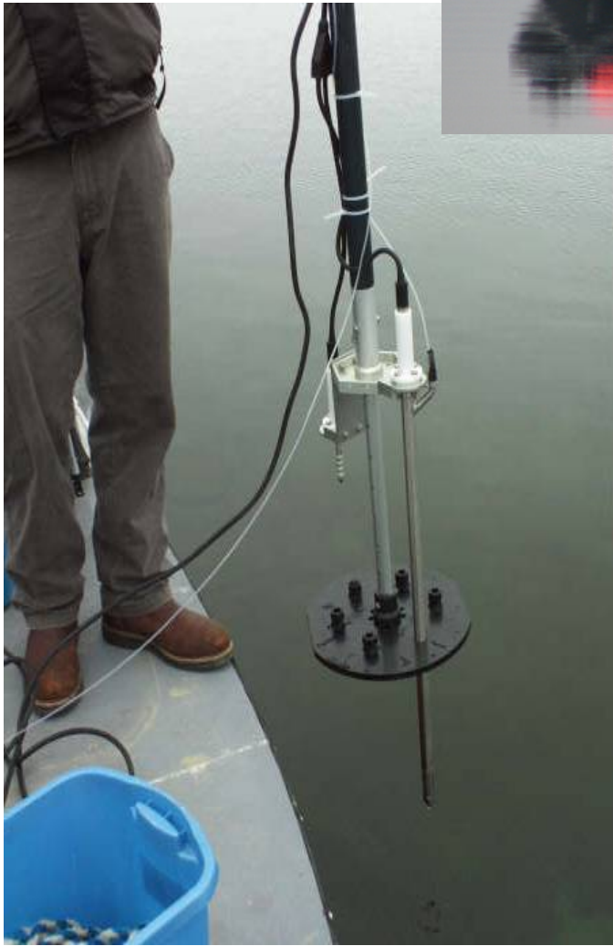
Trident Probe Push Pole Assembly Deployment