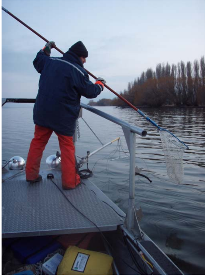
Electrofishing for Whitefish