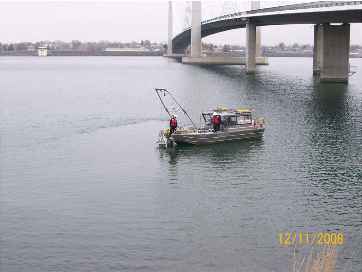
Power Grab Sampler Closeup