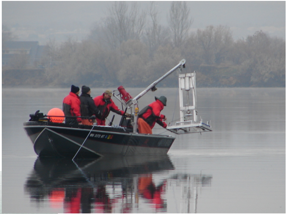
Trident Probe Frame Deployment Test on December 12, 2008