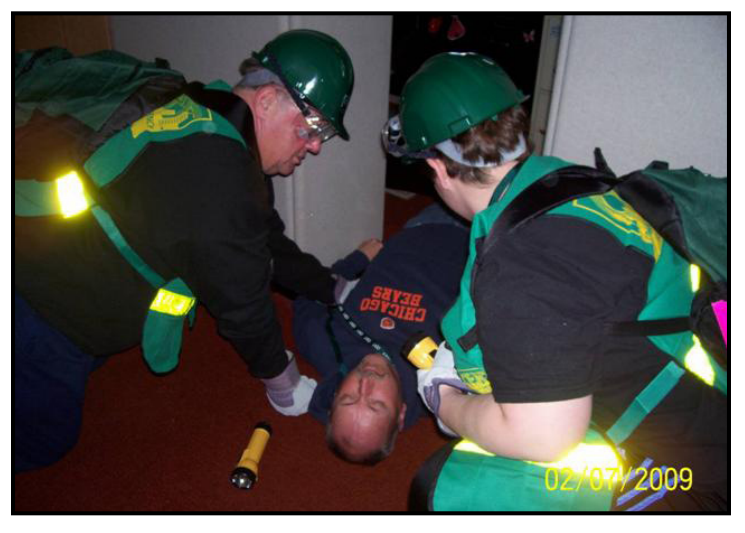
Illinois CERT conducts a search and rescue exercise

In Illinois, the state office runs reports on all local CERTs to ensure that they have accurate information. The reports offer details on all facets of their programs and what is being implemented on a local level. "I think that has al-