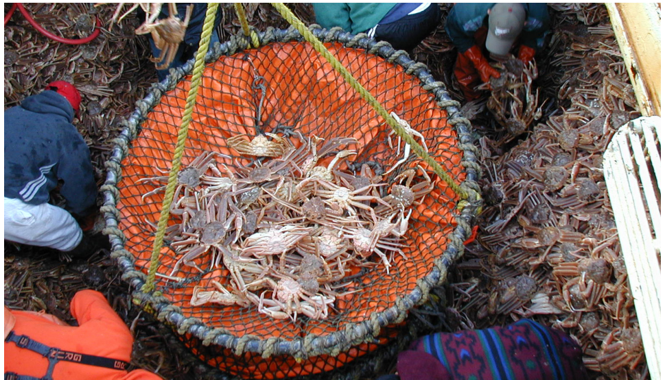
Bering Sea snow crab being off-loaded for processing in Dutch Harbor, Alaska.

NOAA Fisheries releases the 15th Annual Report to Congress on the Status of the Nation's Fisheries. This report documents our national journey toward ending overfishing and rebuilding the nation's fisheries.