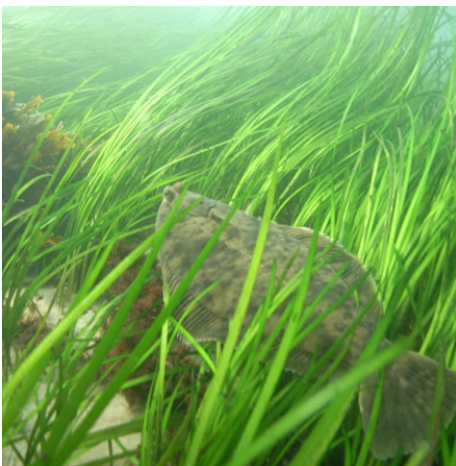
Winter flounder in eelgrass habitat.