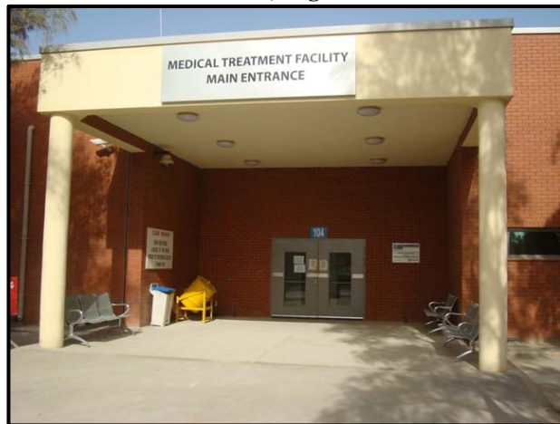
Figure 1. Entrance to Main Hospital in Kandahar, Afghanistan

Source: DoD OIG auditor, February 9, 2011