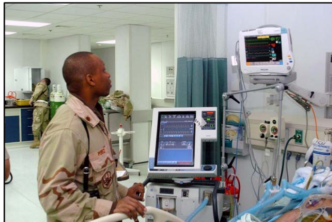
Figure 3. U.S. Air Force Doctor Providing Care in Bagram Air Base, Afghanistan