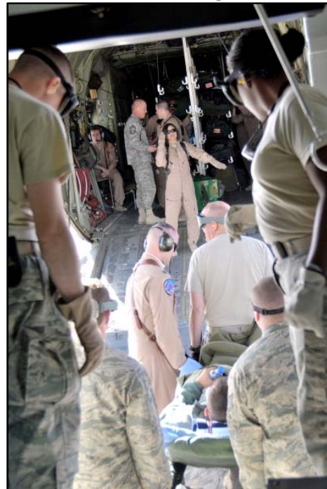
Figure 4. An Aeromedical Evacuation at Kandahar Airfield, Afghanistan