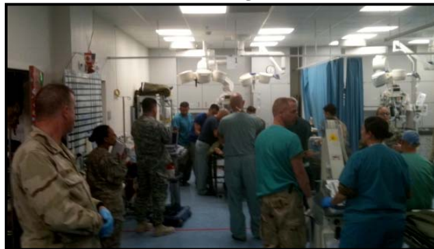
Figure 2. DoD Medical Personnel Providing Care in Kandahar, Afghanistan

On September 15, 2010, USCENTCOM personnel issued an update to their Fragmentary Order 09-1038, stating that contractor personnel must be registered correctly in the electronic medical record to facilitate reimbursement from the contractor. The update states that billing for care provided to contractor personnel is not the responsibility of the medics in Southwest Asia and will be accomplished outside of the USCENTCOM area of responsibility. The update does not provide any other details on how contractor billing will occur.