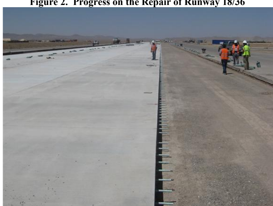
Figure 2. Progress on the Repair of Runway 18/36

Despite the requirements development and design processes, one Air Force repair project did not fully meet DoD's needs upon Government acceptance. An AFCENT official stated that on February 2, 2010, the Deputy Assistant Secretary of the Air Force for Installations, approved the DD Form 1391 for Project ACC101101, "Repair Runway 18/36," at Shindand Air Base, Afghanistan. Figure 2 shows progress on the repair of runway 18/36. Using O&M funds of approximately $36.6 million, the project scope included requirements to remove and replace 75,500 square meters of existing pavement, so the runway could adequately support aircraft operating at Shindand Air Base, to include C-17 aircraft. However, the existing taxiways at Shindand Air Base, which were not included on the DD Form 1391, are 45 feet wide, whereas a C-17 aircraft requires a minimum taxiway width of 50 feet. Therefore, according to an AFCEE official, if a C-17 aircraft were to land on the existing Shindand Air Base runway, the runway would have to close until the C-17 takes off because the C-17 would be unable to taxi off the runway, impacting all other fixed-wing flying operations.