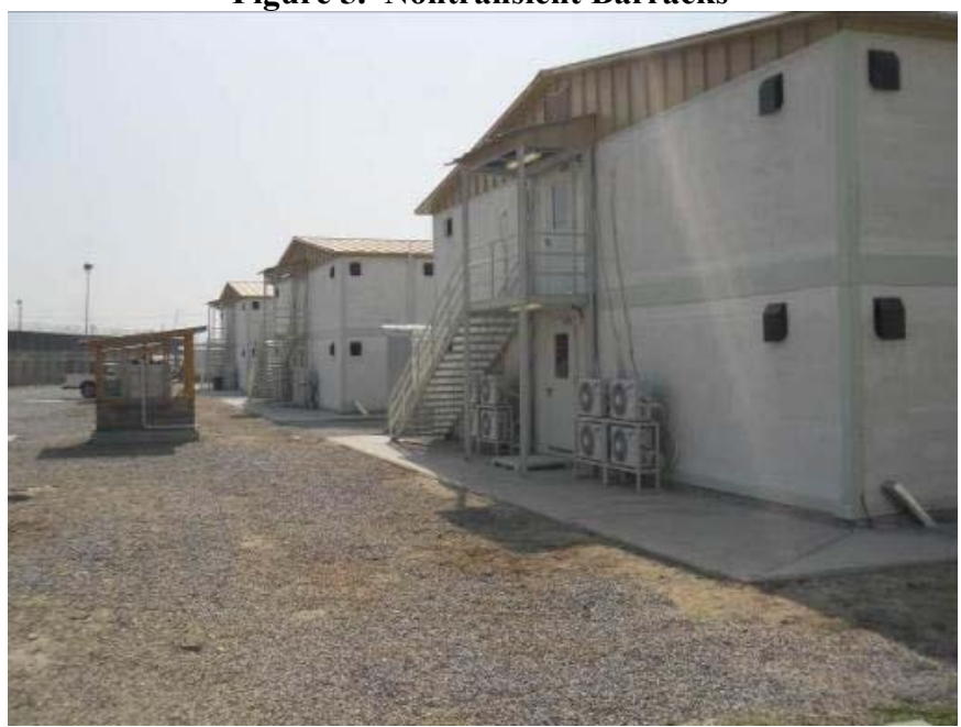
Figure 5. Nontransient Barracks