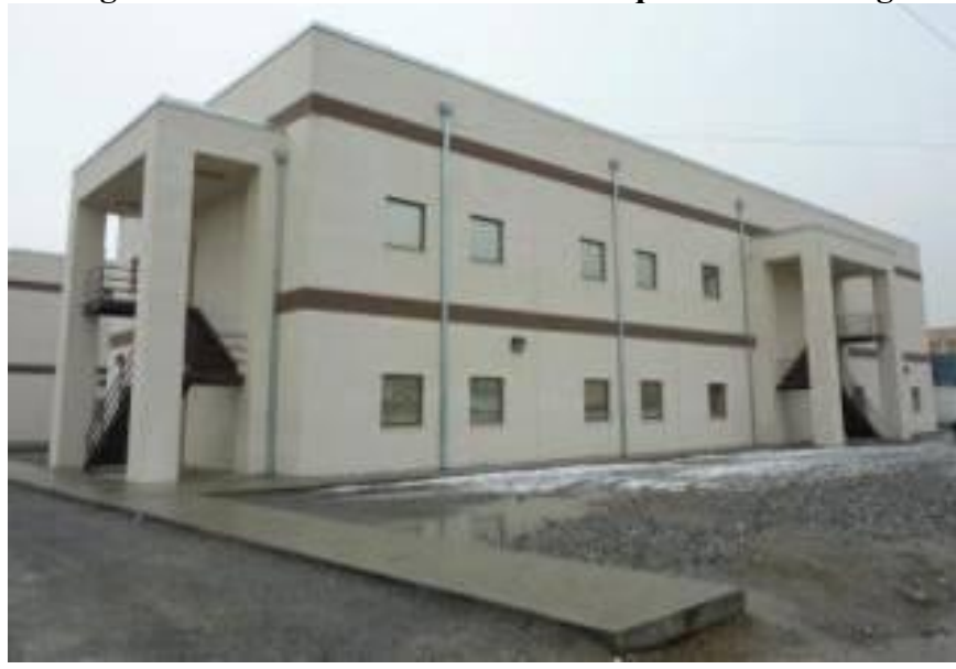
Figure 4. Joint Task Force 435 Headquarters Building

Figure 4 shows the administrative facility constructed, the Joint Task Force 435 Headquarters Building. On July 13, 2011, the Director of Public Works accepted the barracks on a DD Form 1354