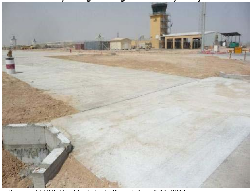
Figure 3. Completed Strategic Apron Portion of Rotary-Wing Parking and Taxiways Project